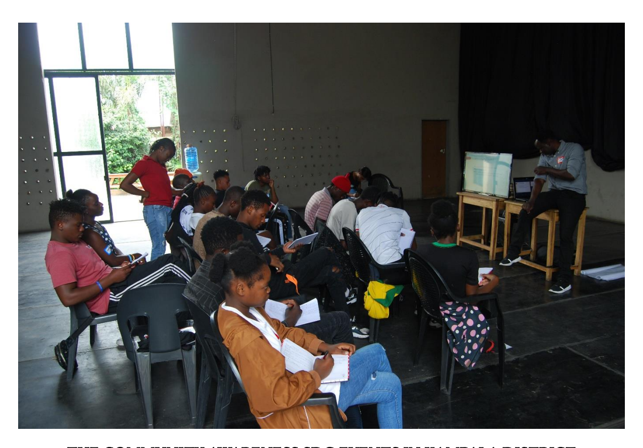
THE COMMUNITY AWARENESS SDG EVENTS IN KAMPALA DISTRICT