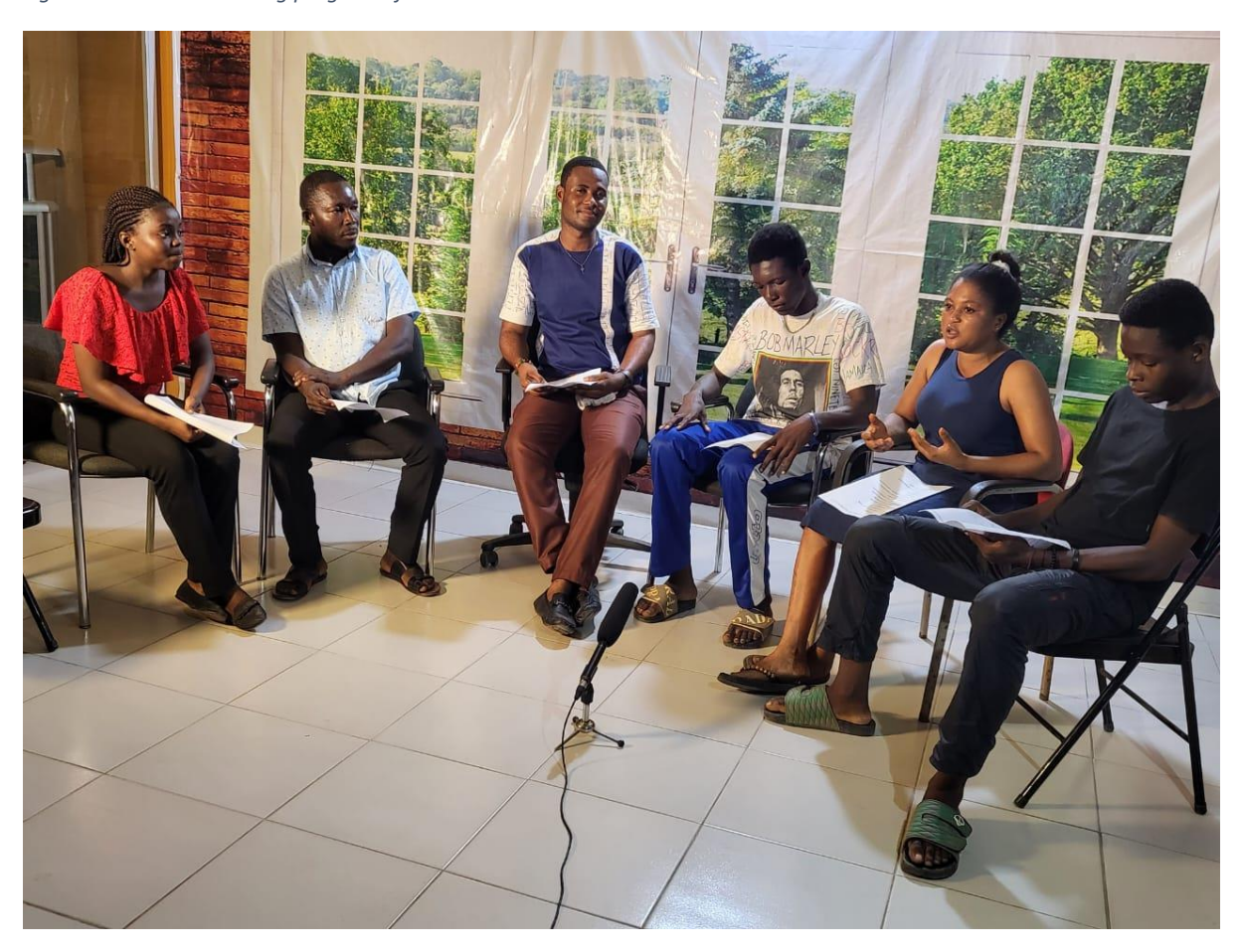
Figure 1 1st Studio-tracking program of Coastal TV

20 out of our 21 Community Radio and Tv station Youth Focal teams (YFPs) across the country, held radio studio tracking programs at their various radio stations after their first Community Youth Forums (1st CYFs) on the localizing the SDGs throughout this February.