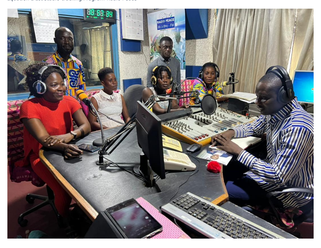
Equation 1 1st Studio-tracking Program-Radio Peace