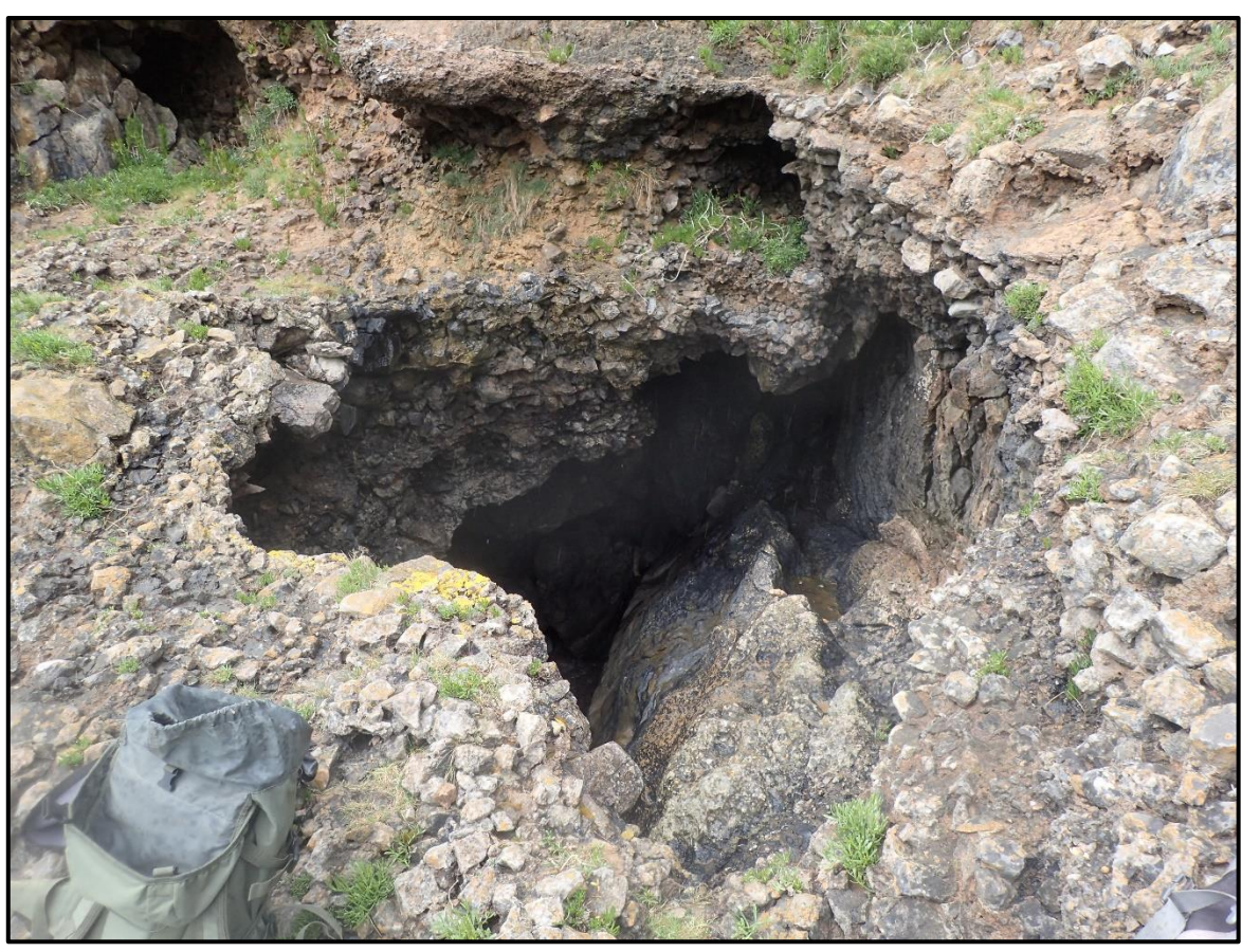
The higher entrance to Cave 43