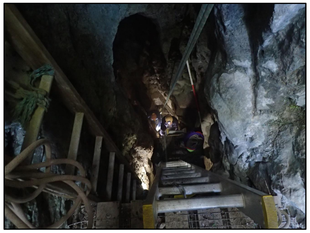
Looking down from the entrance at the activity below