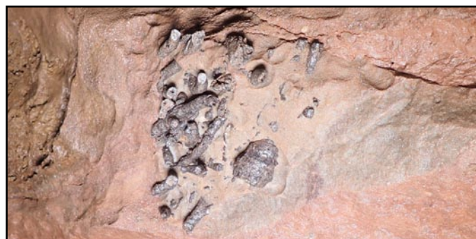
Although locally the rock has a thin covering of fine-grained sediment, the silicified fossils still stand out.