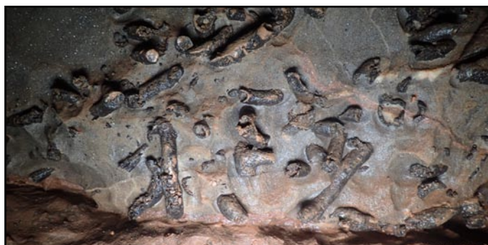
The partly silicified, broken, remains of the colonial rugose coral Siphonodendron martini .