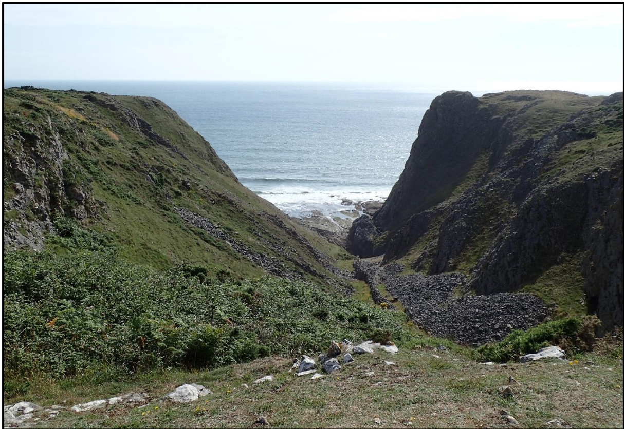
Looking down Foxhole Slade

The tide was low this afternoon, I'm currently reading Aldhouse-Green et al. (2000). Paviland Cave: A Definitive Report, so my main reason for coming over today was to visit the cave and other caves nearby. The weather had brightened up and it was a very pleasant stroll following the coast path route to Foxhole Slade.