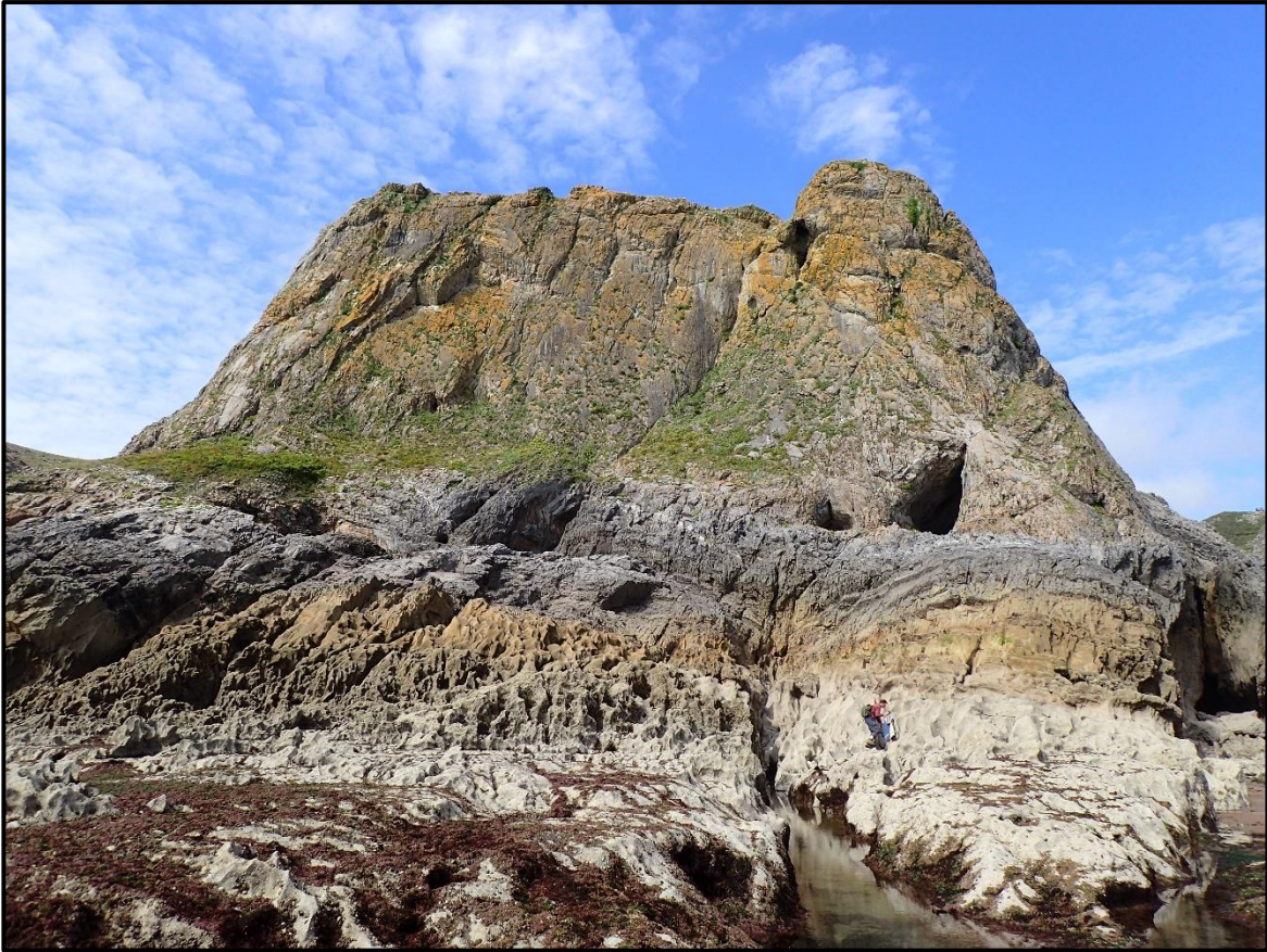
Paviland Cave (right), Hound's Hole (left) Yellow Cap, above Paviland Cave.