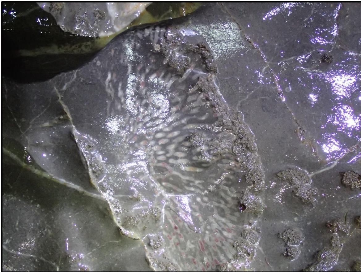
Coral, Ogof y Mor