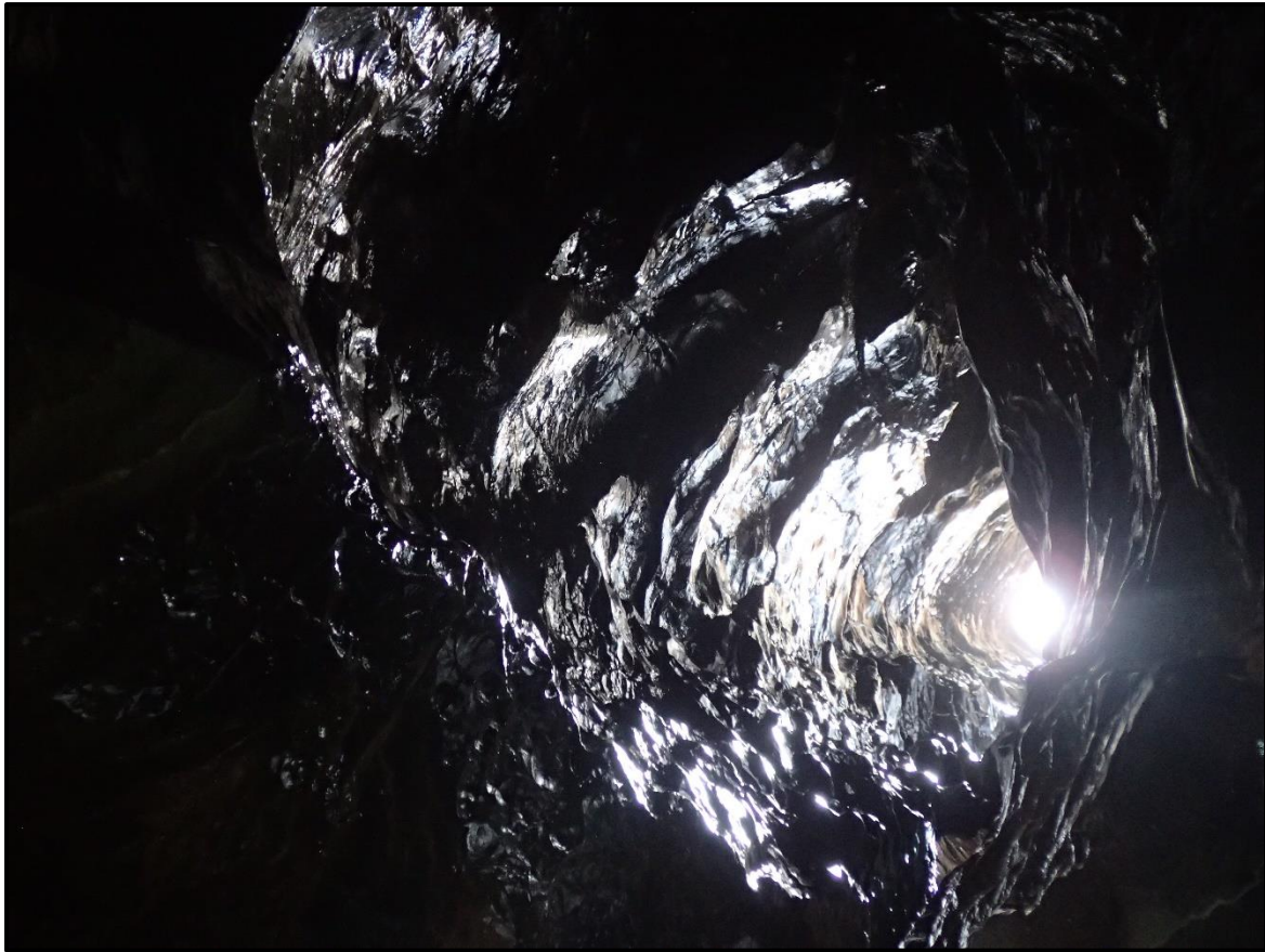
Ogof y Mor