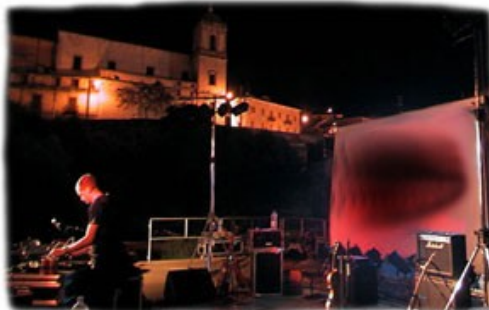
Live at the Festival Invasioni 2001 in Italy.