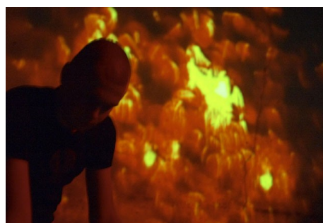
Live at Basement 2004 in Denmark