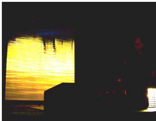
Live at Elysium club 2004 in Austin, USA

- 18 July, 2008 , at Hyperborea VII, Gyar – Music Factory, Budapest, Hungary.