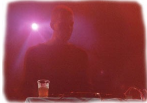
Live at the Eurorock Festival 2000 in Belgium.