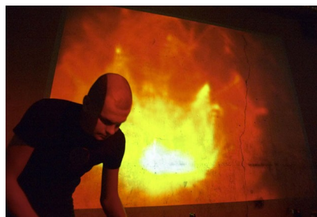
Live at Basement 2004 in Denmark