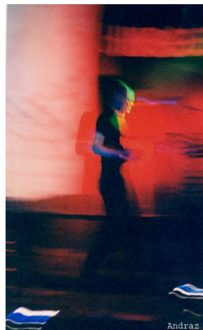
Live at Red Rose 2003 in London UK