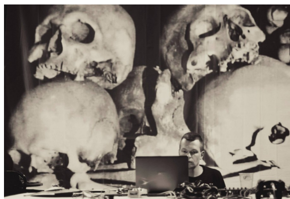
Live at The Valhalla Festival, Norrköping, Sweden.