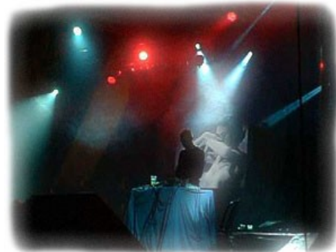
Live at the Eurorock Festival 2000 in Belgium.