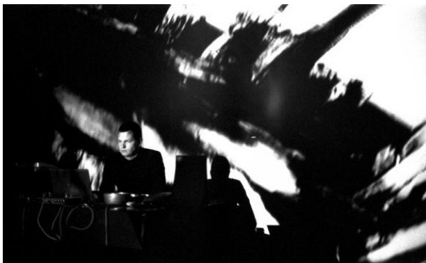
Live at the DOM Club 2010, Moscow, Russia.

- 19 October, 2014 , at Kung Fu Necktie, Philadelphia PA, USA.