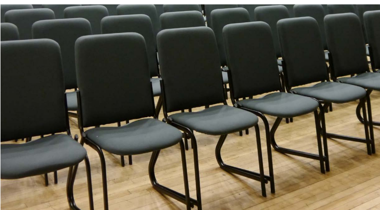
Fully upholstered version also available