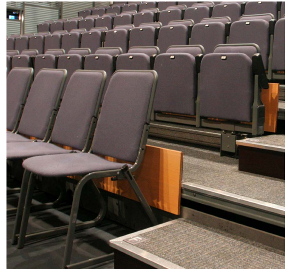
Flexible occasional seating