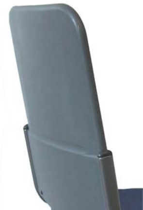
Durable wrap-around plastic outer back prolongs the life of the upholstery