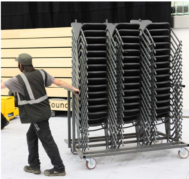
Specially designed trollies aid rapid turn around times. Small quantities of chairs can be easily moved on sack trucks.