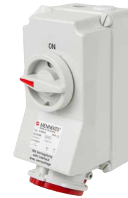
Typical socket required