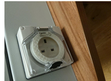
Box is pre-equipped to connect LED aisle lighting

Details of the control cabinet position, and exact details of the socket required, will be included on the seating layout approval drawing.