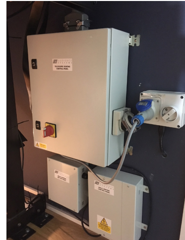
Control box (the two lower boxes are the control panel and battery pack for the aisle lights)