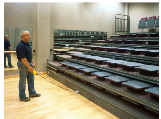
TX Telescopic Platform System being closed