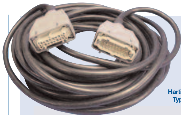
Harting Multi Core Type Cable Set