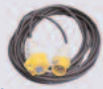
Cee Cable Set