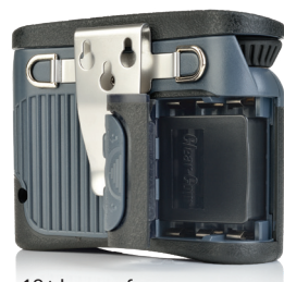
18+ hours of battery operation (door shown open)