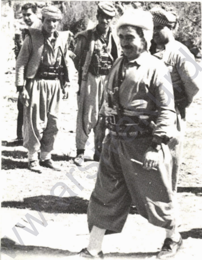
General M. BARZANI, leader for the Kurdish National Liberation struggle.

Our organisation is a progressive revolutionary Political Organisation consisting of Kurdish peasants, workers and intellectuals inside and outside of our country.