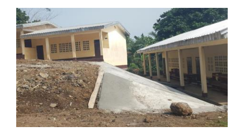
School Campus before renovation