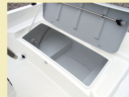
Even bulky equipment fits in the stern storage compartment.