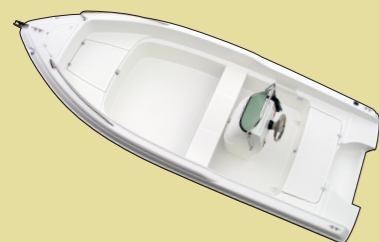
490 Fx with optional bench and console to the front or to the back