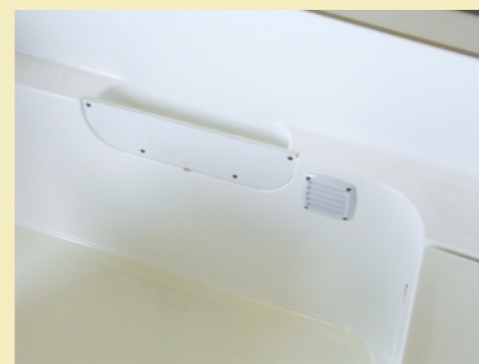
Convenient side shelves for small accessories and ventilation of the stern storage space.