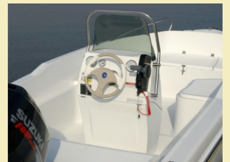
Ergonomically designed console with rubber-grip wheel and rail.