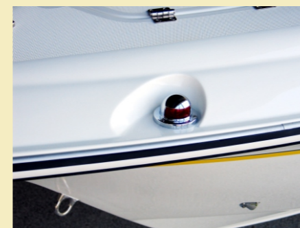
Modern design of the navigation lights in chrome finish.