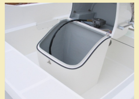
The console offers additional storage space and easy access.