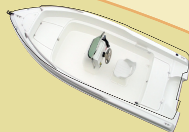
490 Fx with optional driver's seat