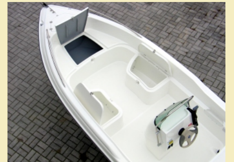
Top view of the 490 Sx' abundant storage spaces.