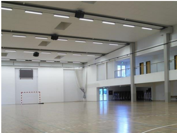
External venue (Spektrum Odder)

Please note: we also encourage some of our local karate kids to sleep over in the Dojo - so if it starts to be crowded we can/will split into a kids/adult's section by Dojo 1 / Dojo 2