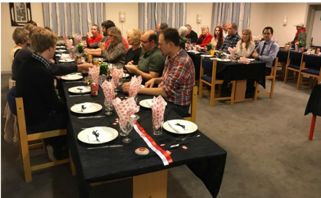
Canteen area (at Dojo)