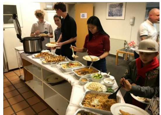
Canteen area (at Dojo)