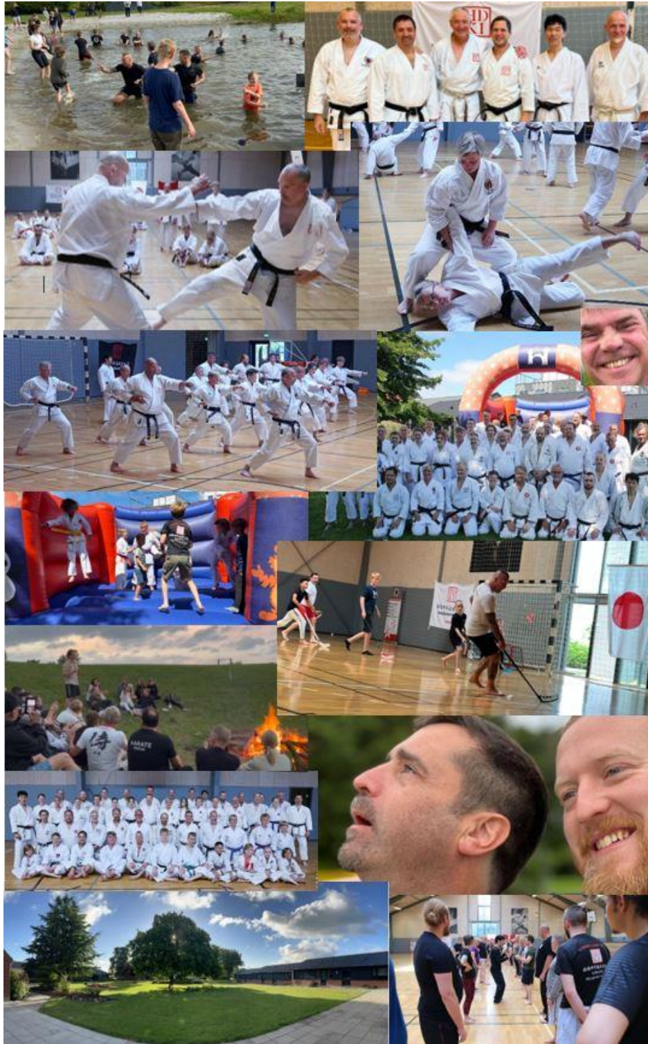
Above: some "memories" from the HDKI Denmark Summer Camp 2022

For more information – or if you have some questions – please contact us at: hdki.denmark@gmail.com