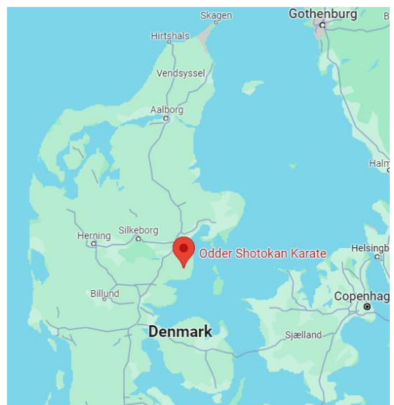
(Location of the HDKI Denmark Summer Camp 2024)