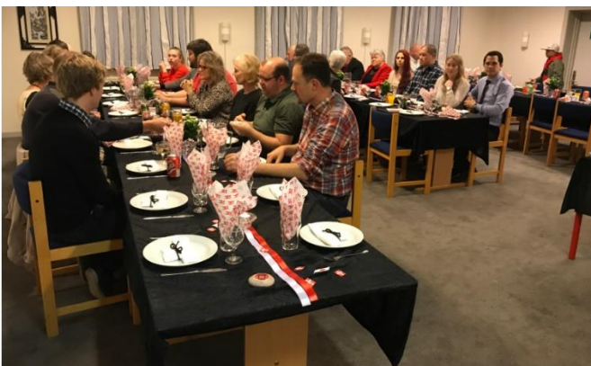
Canteen area (at Dojo)