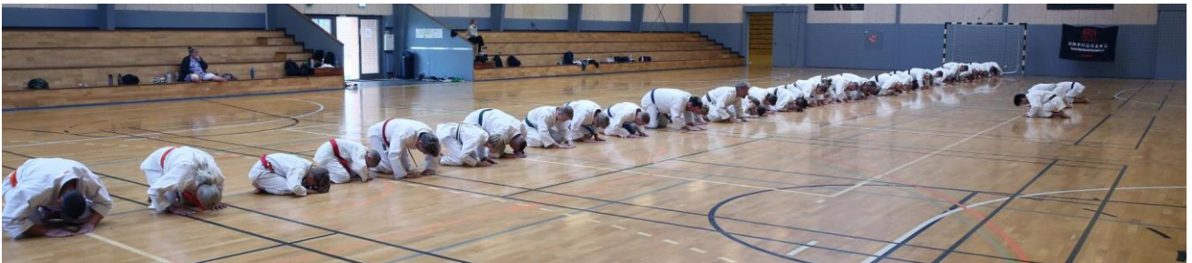
(Summer Camp 2022)

Detailed camp schedule to follow when we get closer!