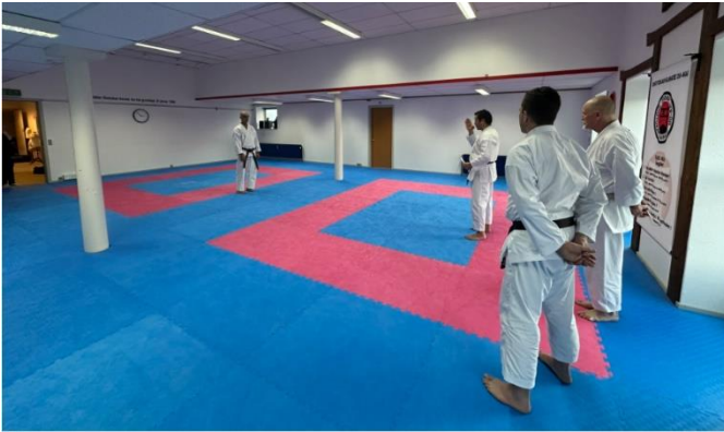
Dojo 1 (and sleeping area for stay overs)

In 2024 the camp will be held in our DOJO premises (all meals are served here) – and if the group becomes larger than what can be hosted in our Dojo a local sports venue (less than 10min in walking distance from the dojo) is pre-booked as a back-up. Whether this will be used or not is subject for # of registrations.