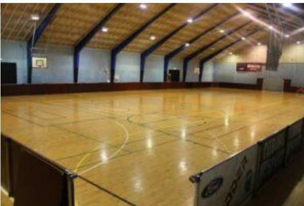
Back-up venue – depends on # of sign-up's

Please note: we also encourage some of our local karate kids to sleep over in the Dojo - so if it starts to be crowded we can/will split into a kids/adult's section by Dojo 1 / Dojo 2