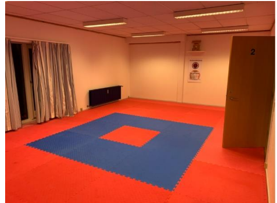
Dojo 2 (sleeping area for stay overs / storage during days)

Please note: we also encourage some of our local karate kids to sleep over in the Dojo - so if it starts to be crowded we can/will split into a kids/adult's section by Dojo 1 / Dojo 2