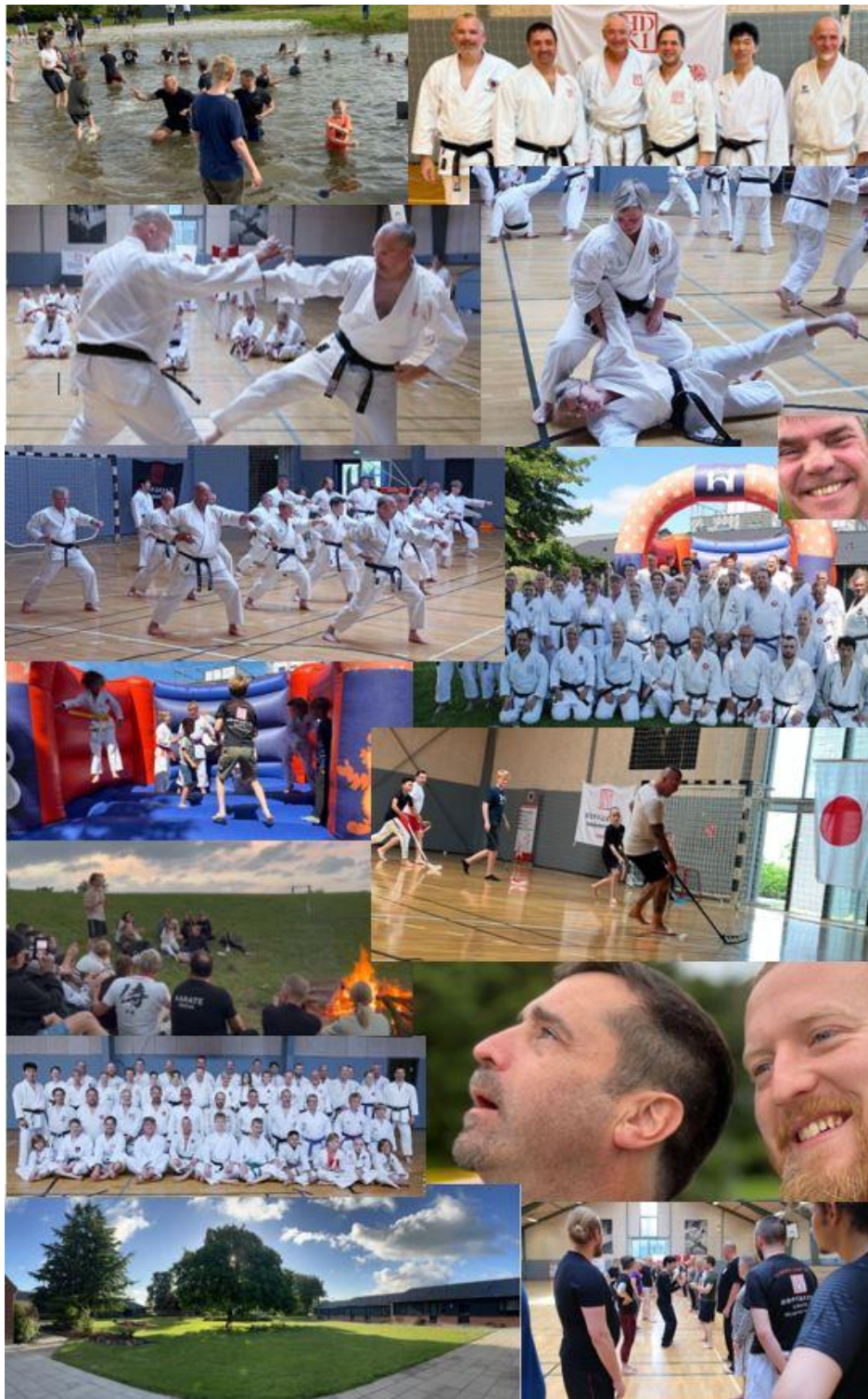
Above: some "memories" from the HDKI Denmark Summer Camp 2022

For more information – or if you have some questions – please contact us at: hdkidenmark@gmail.com