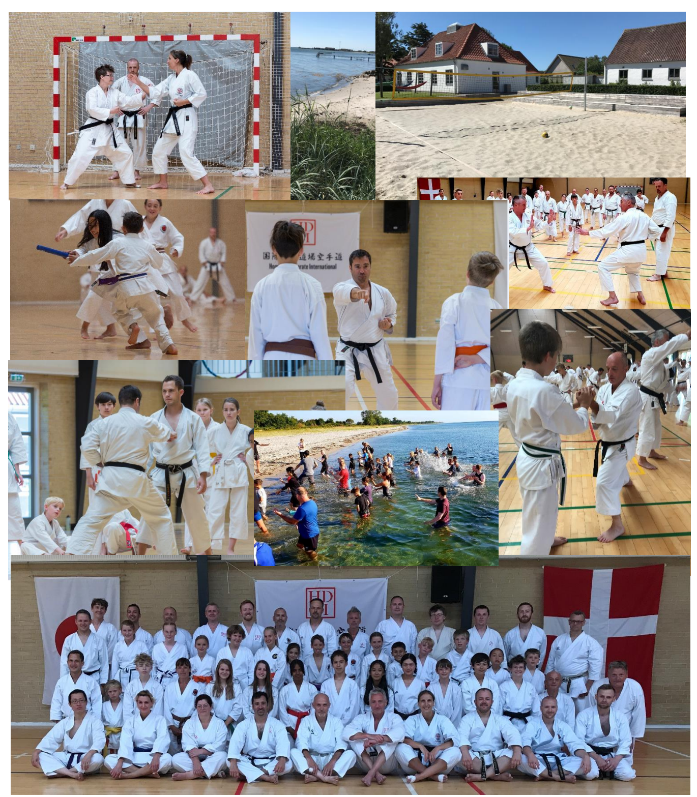
Above: some "memories" from the HDKI Denmark Summer Camp 2017 and 2018.

For more information – or if you have some questions – please contact us at: <a href="https://www.how.example.com">https://www.how.example.com</a> https://www.example.com</a>