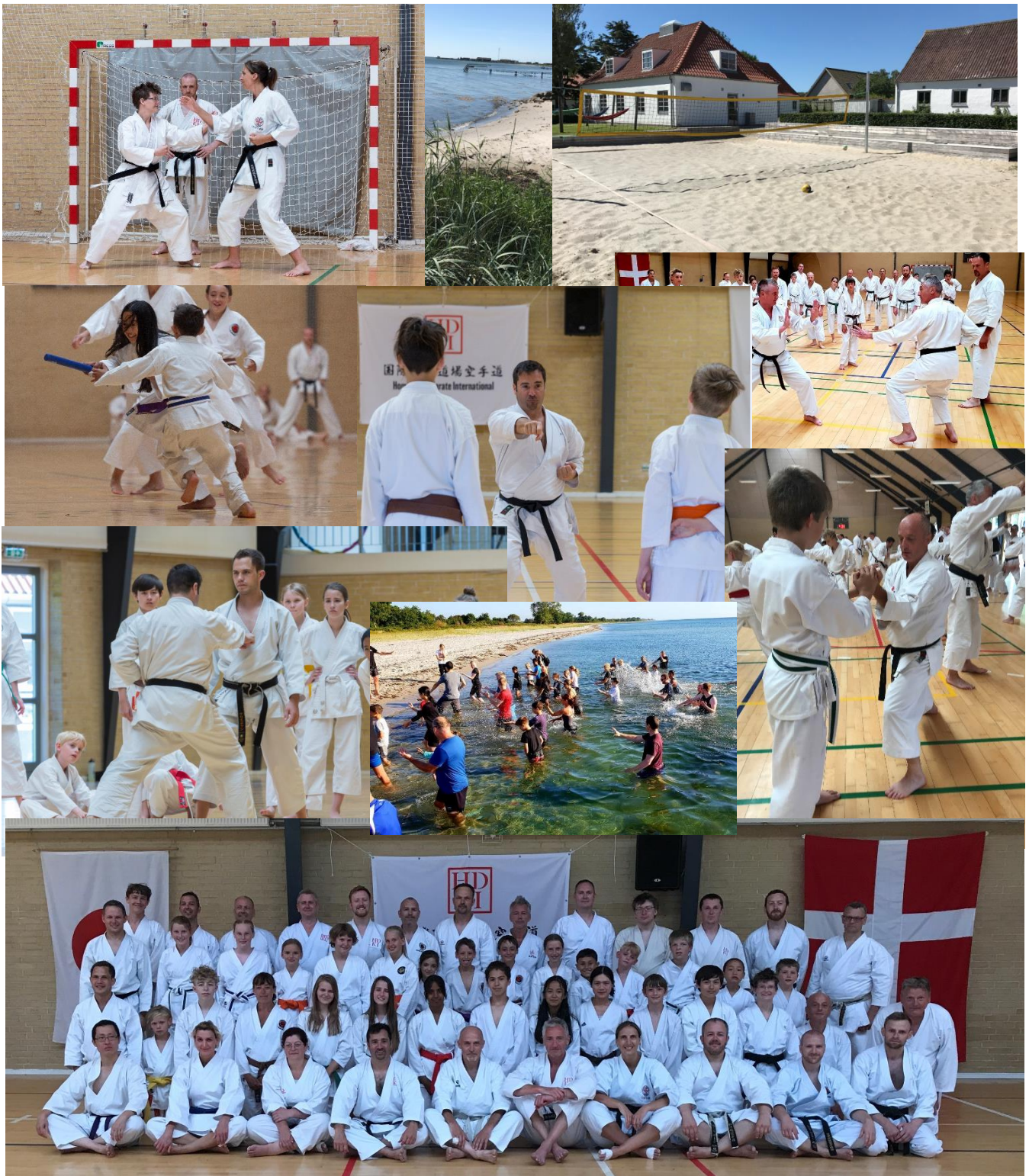
Above: some "memories" from the HDKI Denmark Summer Camp 2017 and 2018.

Campus area, one of the dormitory sections