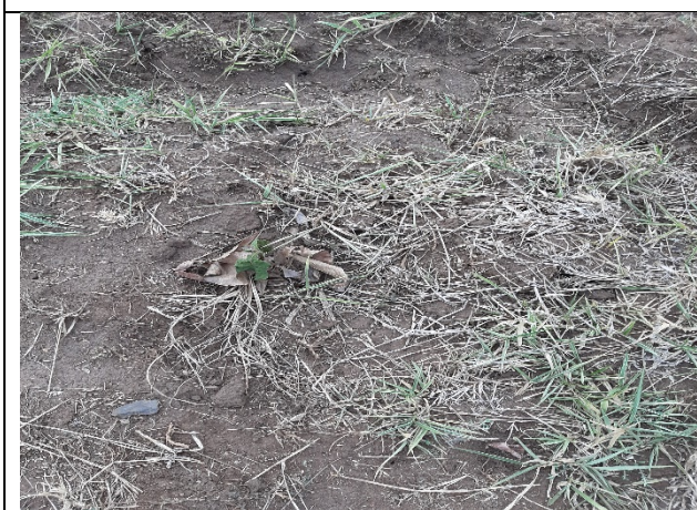
Figure 19: Adyee Food Forest -hit by drought