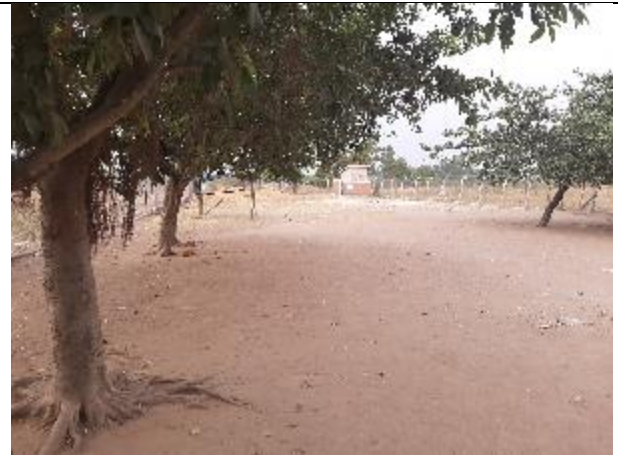
Figure 14: Fencing at Andelizu Market