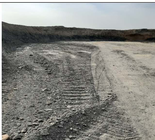
Figure 22: Valley dam under construction at Akinio