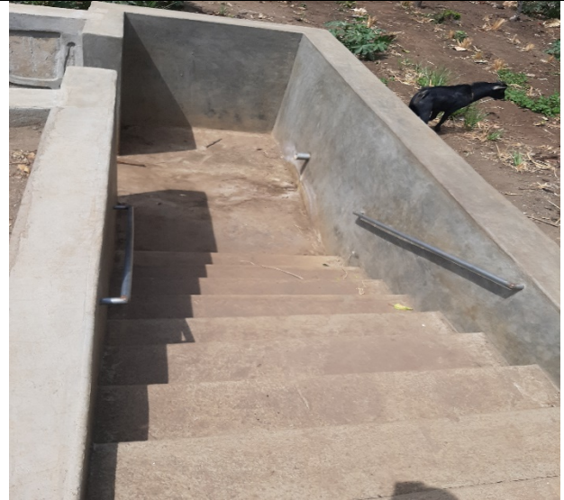
Figure 10: Seasonal spring at Bapa