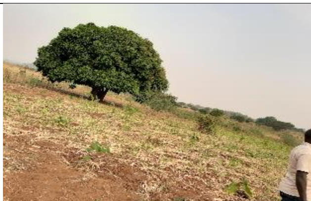
Figure 18: Adribu COU food forest