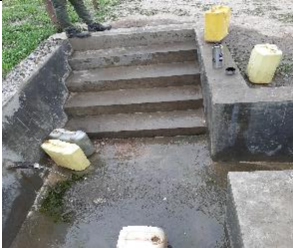
Figure 7: Spring protected at Goyiva