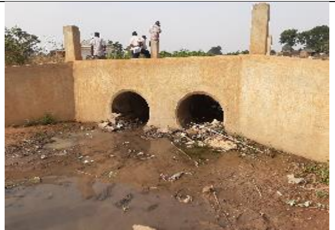
Figure 3: Culvert at Angucaku-st.Bakita-Oludri road