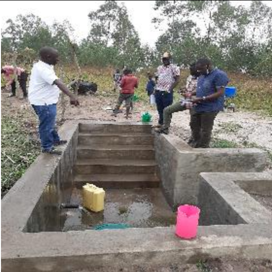
Figure 9: Spring protection at Oka