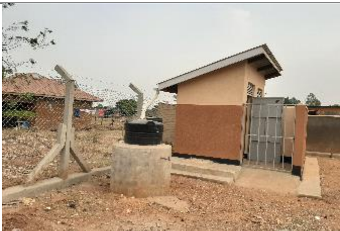
Figure 15: Toilet with Rainwater Harvesting at Ombeteni