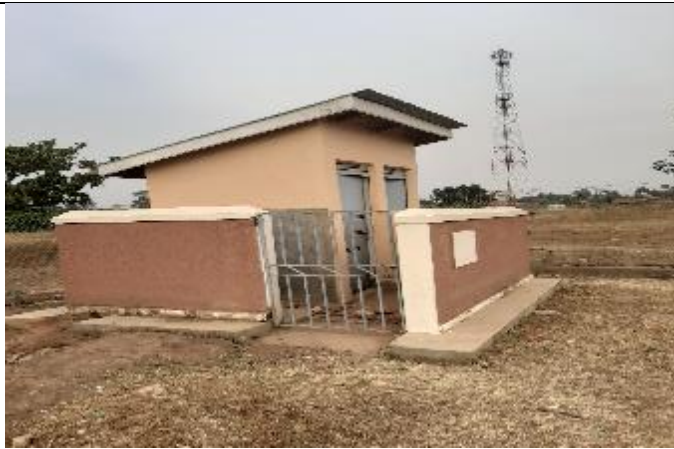
Figure 13: Toilet at Andelizu Market