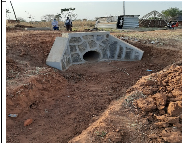
Figure 4: Culvert along Tee-Neam-Akado Primary School road