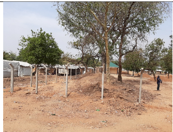
Figure 16: Fencing at Imvepi point J market