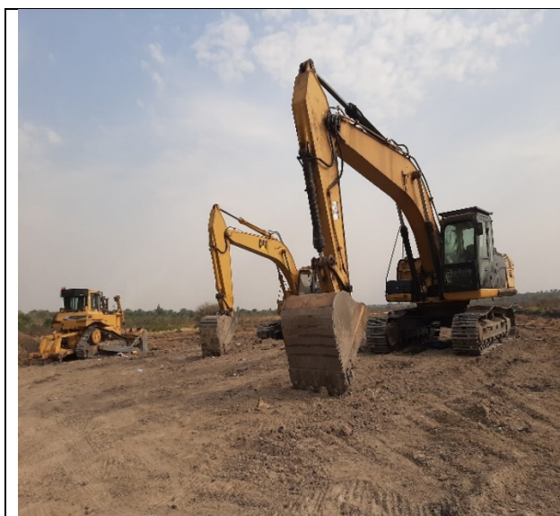
Figure 21: Equipment at Akinio Valley Dam-60 cubic metres