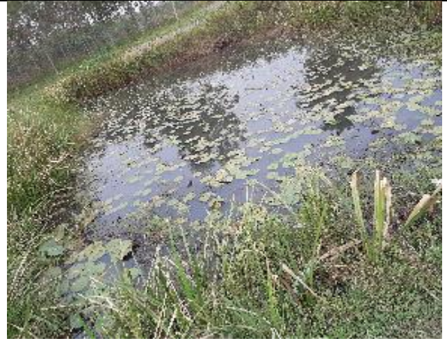
Figure 8: Water pond at Goyiva spring