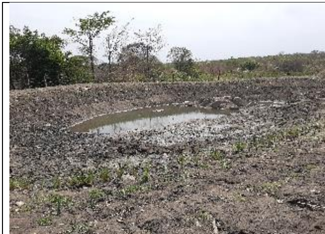
Figure 11: Pond at Bapa

Recommendation: If resources permit excavation should reach the clay soils to enhance water retention of the pond. If this does not happen, the rate of siltation of these ponds will be higher and desilting will be difficult and costly.