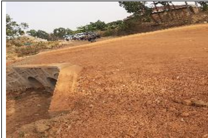
Figure 2: Culvert at Angucaku-st.Bakita-Oludri road