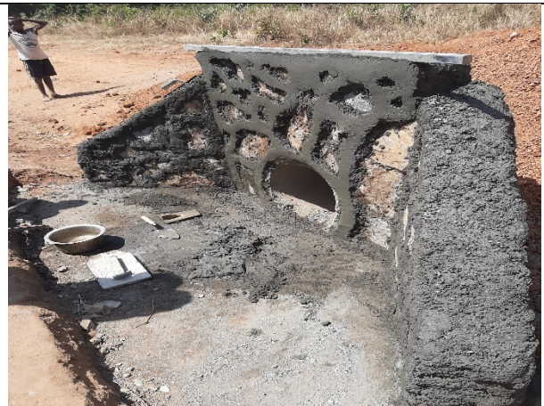
Figure 5: Culvert along Tumattoo-Laborom Road