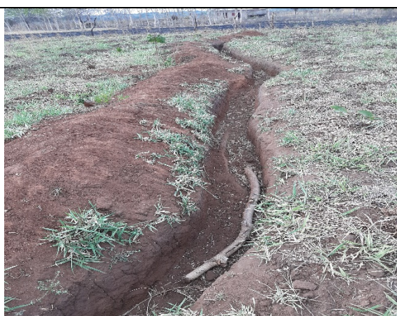
Figure 20: Bio-Swells with filtration pit at Adyee Food forest