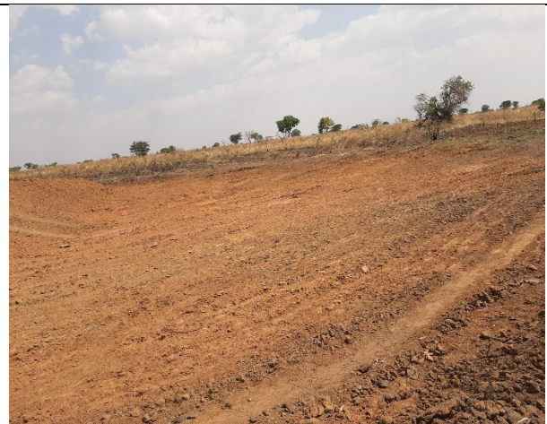
Figure 12: Pond being excavated at Lalwal