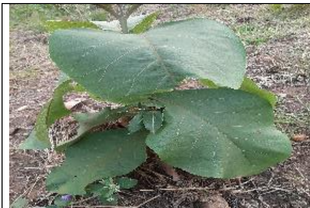
Figure 17: Teak at Offaka PS food forest