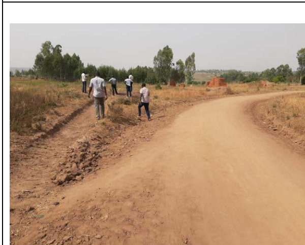
Figure 6: Community access Road Ewadri P.S to Kasikasi