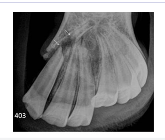
Figure 2: This radiograph was taken Jan. 10, 2009 showing a fracture and dislocation of 403. Note the apical part of 403 (arrow) is located within the alveolar bone, but the remainder of the tooth (arrow) is dislocated. 401 and 402 are dislocation but not fractured.

The horse was anaesthetized and the mandibular fracture was reduced and stabilized with steel wire around the incisors fixed to the right mandibular premolar teeth (fig 3) using an established technique [7]. The horse was discharged from the Hospital after 3 days, and the owners were instructed to allow liquid food only for the following week. The wound healed uneventfully and the horse returned to the clinic for a routine checks after 1 month (fig 3), 3 months post operatively (fig 4). At the 3 month check, the mandibular fracture had healed and the steel-wires were removed.