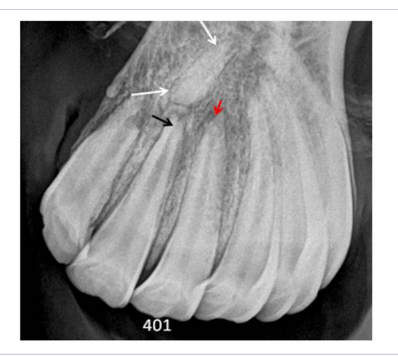
Figure 6: This radiograph is taken Feb. 8. 2012 showing rounded apices of 401 and 402 (red and black arrows). On the radiograph the fragment of 403 is projected axially due to oblique projection (between the 2 white arrows), is now very homogeneous in opacity, has unshaped edges and is significantly larger in transverse diameter due to cementosis in the periodontal ligament.