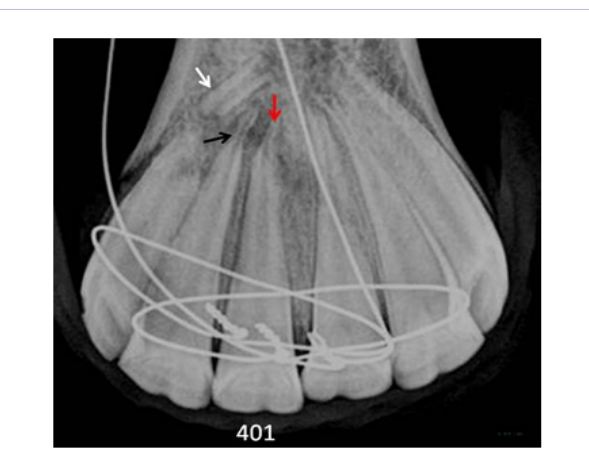
Figure 4: This radiograph was taken April 4, 2009 showing a marked thinning of the apical parts of 401 and 402 (red and black arrows) as a sign of external replacement resorption. The apical fragment of 403 is slightly increased in opacity (white arrow). After this radiograph was taken, the fixation-wires were removed.

Recheck was performed at the owner's premises every 2nd year with the final check 9 years after the acute fracture (figs 5, 6, 7, 8, 9). It was observed, that the free fracture-element of apex of 403 persisted for 6 years whereas the resorption of the non-fractured apex of 401 and 402 was completed after13 months. After 2 years black colored dentin area was observed in the occlusal surface of 401 and 402. This persisted during the rest of the follow up period (7 years) (fig 10, 11 and 12). In the latest final follow up visits, photographs of the occlusal surface of the mandible were taken (Fig 10, 11, 12). These showed normal alignment of the mandibular incisors arcade.