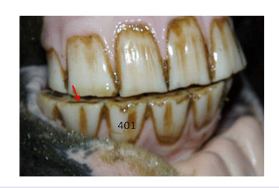
Figure 10: This photographic was taken Feb. 8. 2012 showing normal occlusal surface. Blood stained black areas in the dentine can be seen in 401 and 402. Normal mandibular and maxillary arcades.