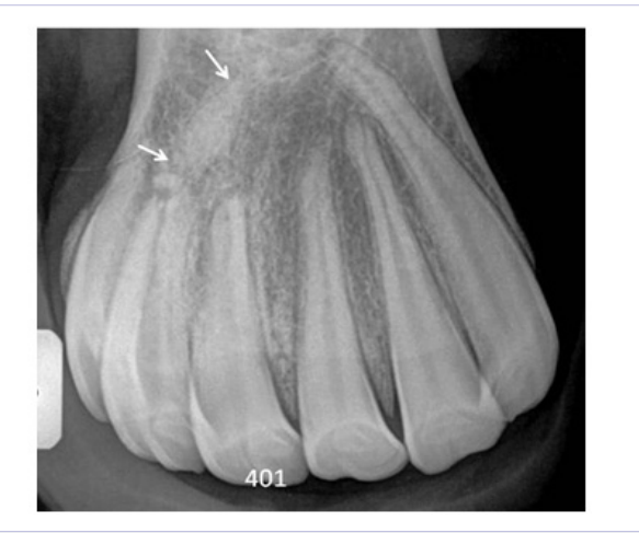
Figure 7: This radiograph was taken Jan. 14. 2014 showing very blurred contours of the fragment, again projected over 402 (between 2 white arrows).

Figure 6: This radiograph is taken Feb. 8. 2012 showing rounded apices of 401 and 402 (red and black arrows). On the radiograph the fragment of 403 is projected axially due to oblique projection (between the 2 white arrows), is now very homogeneous in opacity, has unshaped edges and is significantly larger in transverse diameter due to cementosis in the periodontal ligament.