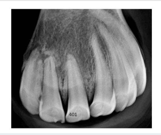
Figure 9: This radiograph was taken Feb. 14. 2018 showing shorter right incisors (401, 402,403) compared to those on the left (301,302,303).