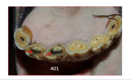
Figure 11: This photographic picture was taken Jan. 29. 2016 showing normal occlusal surface, but the black stained dentine is observed 401 and 402 (red arrows).

Citation: Jens A (2019) Retained Roots After Tooth Fracture and Replantation In A Horse. SOJ Vet Sci 5(1): 1-5. DOI:10.15226/2381-2907/5/1/00166