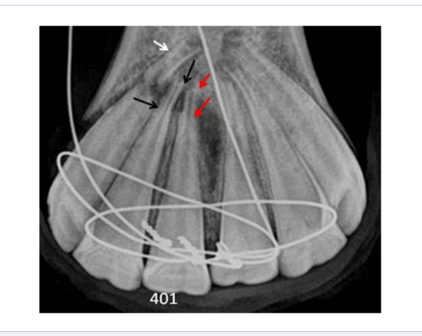
Figure 3: This radiograph was taken Feb. 5, 2009 showing the fixation wire around 5 incisors. The fixation to the premolars in not included in the image. The fracture fragment of 403 is observed unchanged (white arrow). The apical parts of 401 and 402 are slightly thinner (between the black and red arrows). Incisors alignment appears satisfactory.

The horse was anaesthetized and the mandibular fracture was reduced and stabilized with steel wire around the incisors fixed to the right mandibular premolar teeth (fig 3) using an established technique [7]. The horse was discharged from the Hospital after 3 days, and the owners were instructed to allow liquid food only for the following week. The wound healed uneventfully and the horse returned to the clinic for a routine checks after 1 month (fig 3), 3 months post operatively (fig 4). At the 3 month check, the mandibular fracture had healed and the steel-wires were removed.