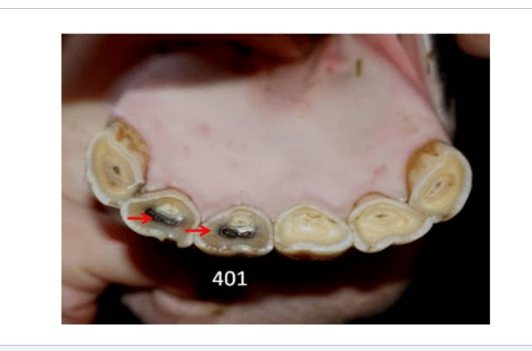
Figure 12: This photographic picture was taken Feb. 14. 2018 showing the normal wearing of all the mandibular incisors. The miscolored dentin (red arrows) in 401 and 402 is the same as seen 2 years earlier (see Fig 11).

The length of the mandibular incisors at the fracture site (401 to 403) was gradually reduced, but the pulp diameters seem to be of the same size as the noninvolved incisors. It is probable that vascularisation to the roots was restored. The alveolar bone adjacent to the affected incisors was replaced with normal trabucular bone tissue. (fig 7 and 8 compared with fig 3) after the resorption of the apical end of the teeth.