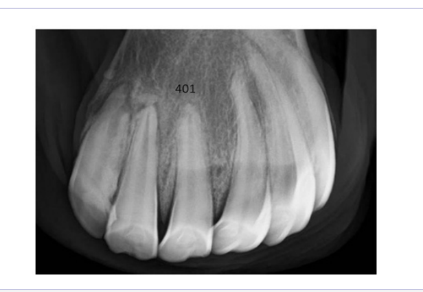
Figure 8: This radiograph was taken Jan. 29. 2016 showing very regular trabecular bone pattern in the area proximal to 401,402,403. The free fragment has now been resorped totally.