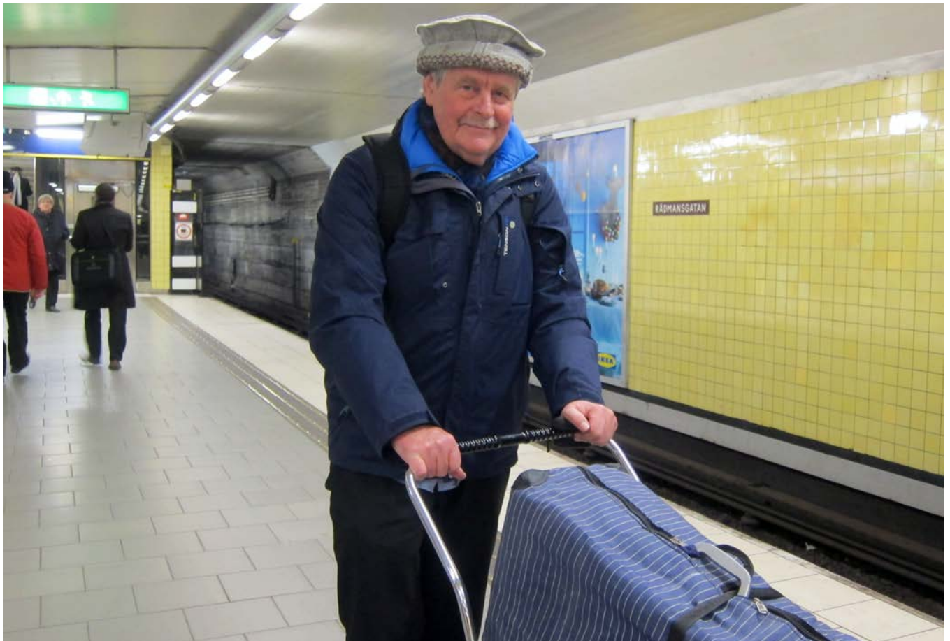
Back to Lund