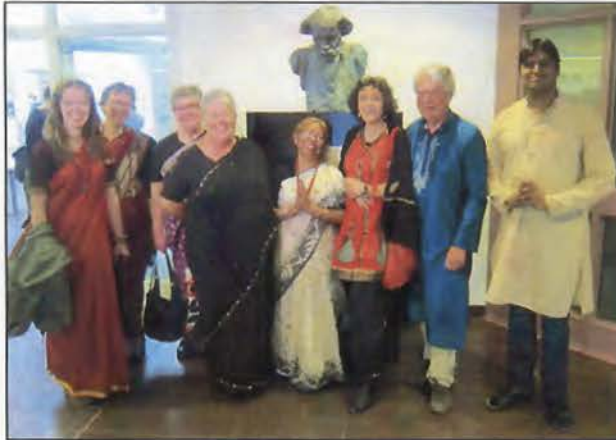
Tagore International Choir in front of the Tagore bust.