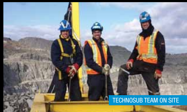
TECHNOSUB TEAM ON SITE