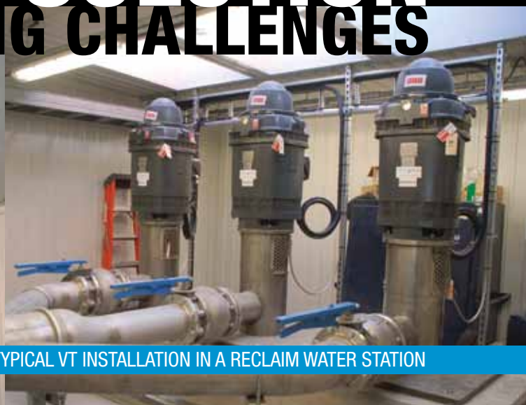
TYPICAL VT INSTALLATION IN A RECLAIM WATER STATION

Technosub service goes beyond providing pumping solutions. Our engineers and technical representatives are always available to solve pumping challenges, at every stage of the process, anywhere, any time.