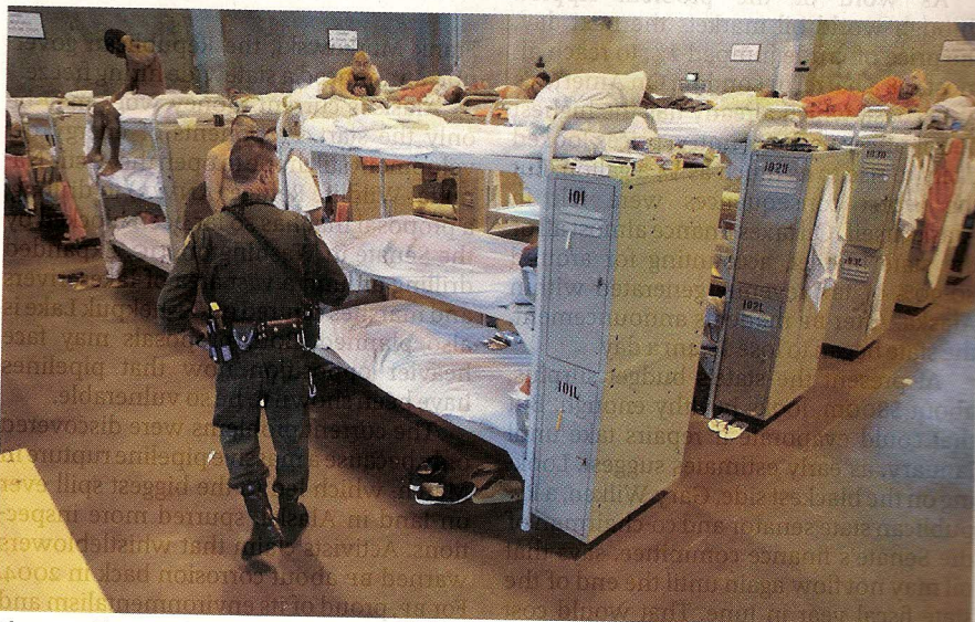
Three strikes means triple-deckers