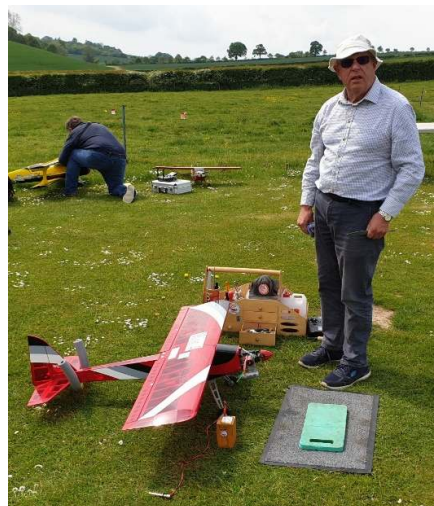
Another lovely PADMAC member getting things ready...