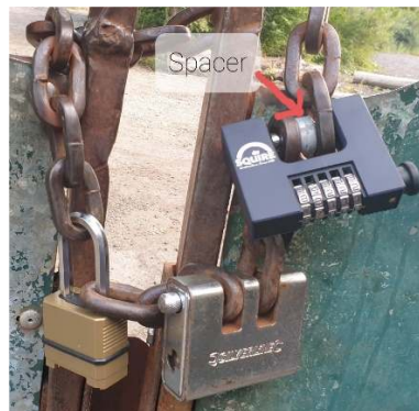
Image shows our new lock (top right). Remember, the gate should always be closed and the lock locked with number scrambled. If unsure when leaving it is always best to lock the gate.

PLEASE REMEMBER to 'scramble' the lock number and lock the lock when on the field as well as when leaving the site so that the number does not fall into the wrong hands.