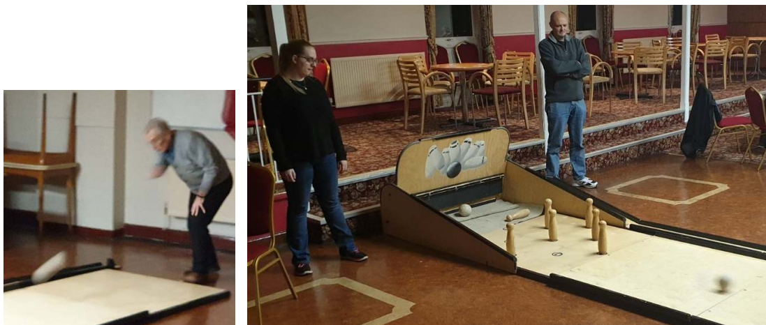
Action shots from the night..