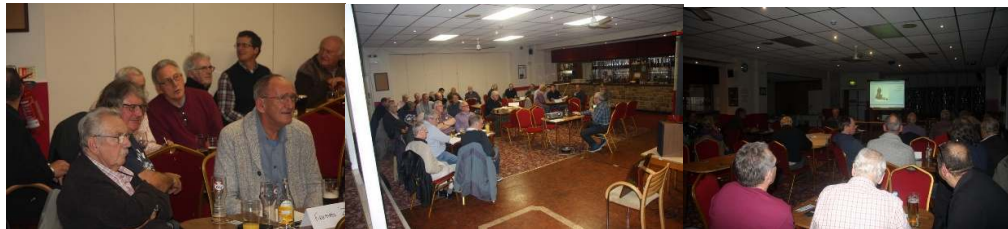
Note: Photos from 2018 event

Once again the BMFA's Southern Area Balsa Brain Quiz was hosted by the Firebirds this year, attendance was good with the Firebirds putting in 2 teams, but like last year our teams didn't come near the top... At half-time there was an excellent free buffet (funded by the Southern Area).