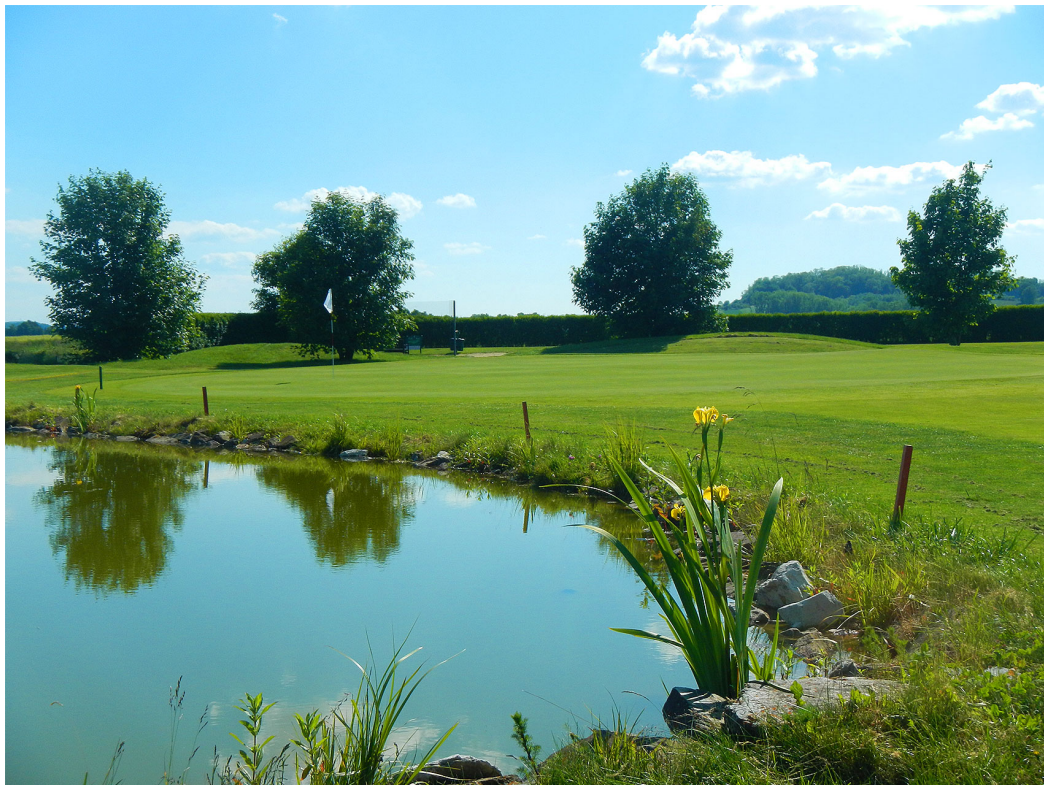
Green Hole 3