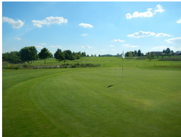
Green Hole 8