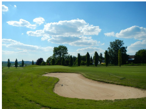
Fairway Bunker Hole 14

The 18-hole course extends over two levels. The first level is below the new clubhouse opened in 2005 and finds its attraction in several water hazards. The second level is about 20 meters higher and forms a kind of high plateau. The challenging course has a length of 5848 m and is characterized by its extremely short distances between the holes. It is a par 71, with slope 129 (yellow tees).