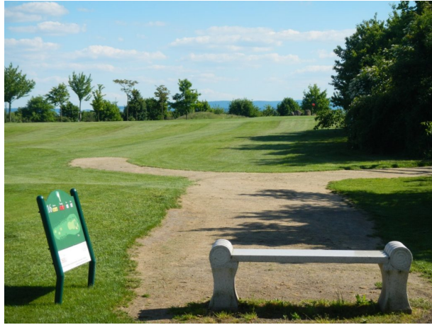
Tee box Hole 16