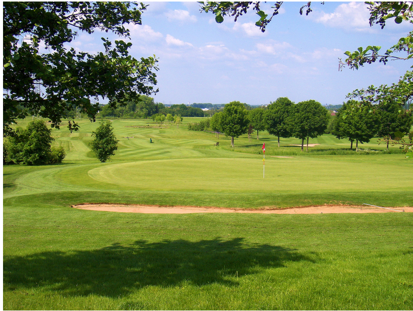
Green Hole 9