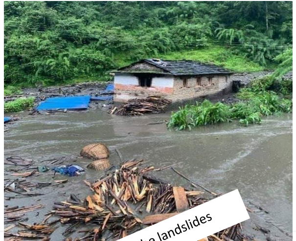
Houses damaged by the landslides