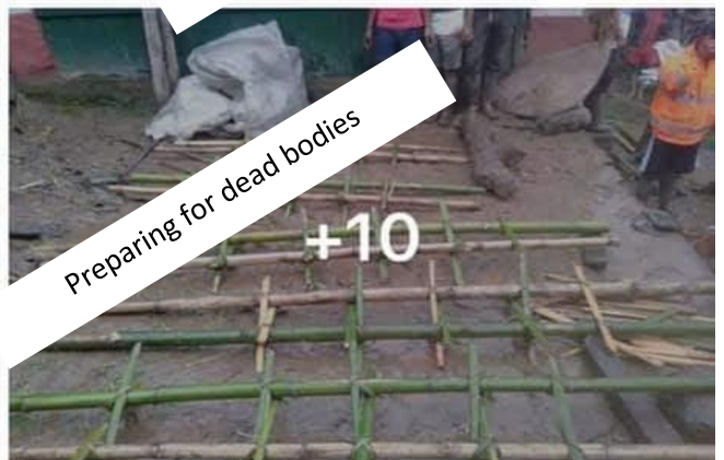
Preparing for dead bodies +10