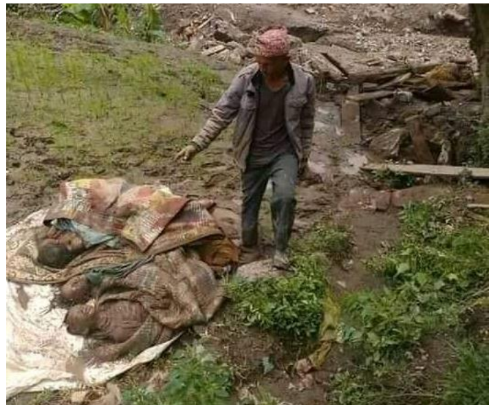
Recovered dead bodies of children from landslide in Myagdi