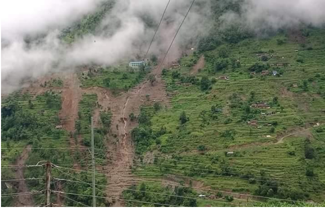
Landslides sweeping villages on the mountains