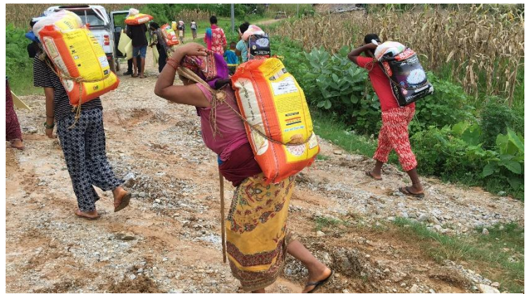
BP Bhanjyang in Tanahu, serving the poor communities, 24 July.

2. Funds support where possible: No amount is less, as a drop makes ocean. At the organisaitonal level there might be more funds, but in the past many individuals also have given so much out of their own needs. Kindly, do not feel