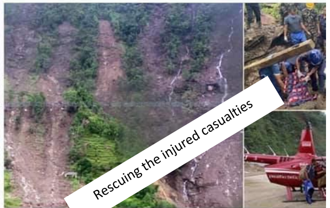
Rescuing the injured casualties