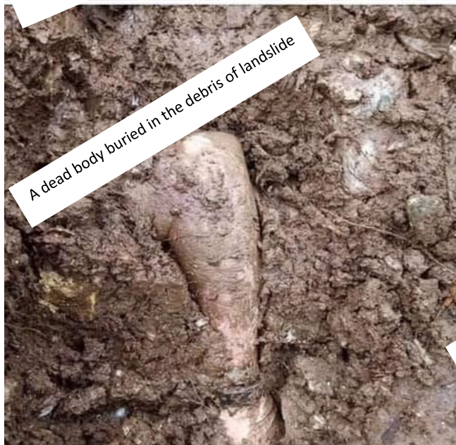
A dead body buried in the debris of landslide