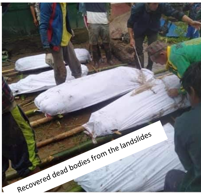
Recovered dead bodies from the landslides