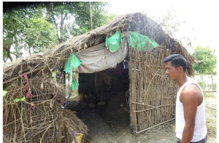
Nothing left in the house, all swept by flood

2.2. Response update: Being located on the border side, Sarawal is one of the highly affected areas by COVID-19 and they have used their resources in responding to COVID-19 response, such as running quarantines for hundreds of people and supporting their needs for survival. When we approached them if they would need help at that time, the local government people said that they were managing the COVID-19 response at the minimum level, and asked us to help if there is flood during the monsoon. There are around 500 families highly affected by the flood who lost their livelihoods and all food stock needing emergency help for survival. The local government is not able to respond to those needs and therefore, requests us to help to those people to overcome hunger they are going through at this moment. There will be livelihood recovery needs to be addressed later.