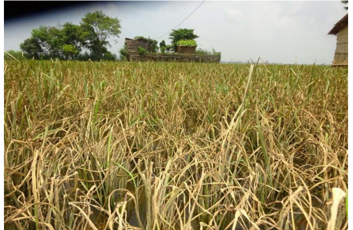
Paddy field destroyed/dried due to heat of water in stem

Sarawal, Nawalparasi which is one of the existing working areas of ACN that is inundated due to incessant rainfall in Nawalparasi. The flood has destroyed many houses, livestock, killed and injured number of people, many families have been displaced and ward nos 6 and 7 are highly affected 4 . Only in Sarawal Rural Municipality, There have been 4 time heavy flood in last two weeks. Around 50 houses are totally destroyed and one individual got his leg fractured while trying to save his goat from the flood. Due to poor financial status, his treatment has been in critical state. However, local people and his neighbour have managed to support with few contribution on their own. ACN is also taking part in his treatment. Around 2529.3 metre square of land grown with crops has been totally destroyed.