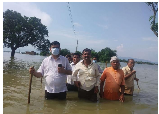
All surrounding, paddy field sank in the flood-water

We aim to cover 150 (out of 500) most needy families out of those affected families. For each family, for food supplies it costs around Rs. 4000 and for tin sheets (approx. 18 sheets), Rs. 20,000. So the total need for financial support would be Rs. 36,00,000.