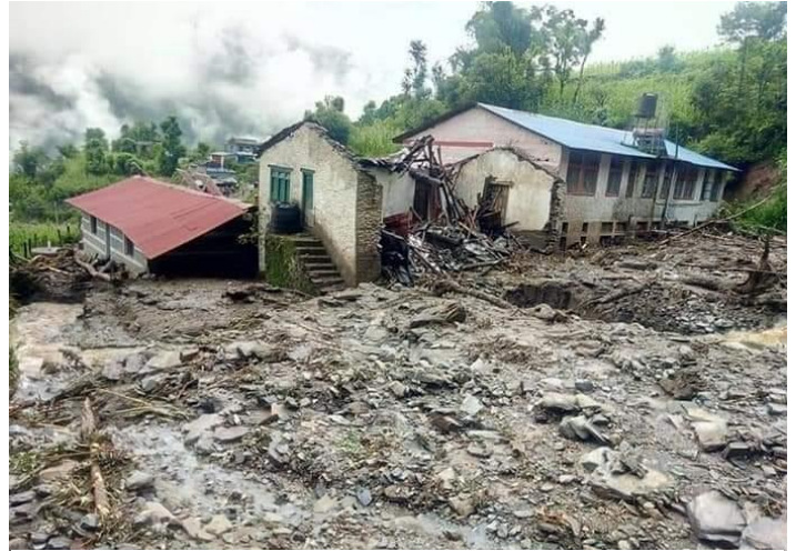
Remaining parts of the houses after the landslide in Myagdi