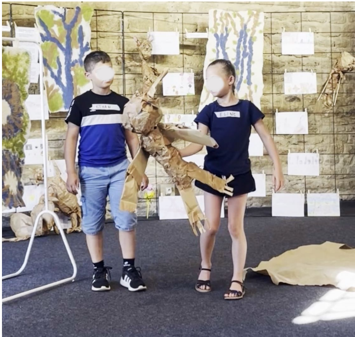
Presentation of the PAG Project (Globalized Artistic Projects) at the Felt Museum in Mouzon (France).