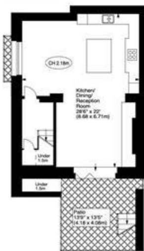
Lower Ground Floor (57.21 sq m)