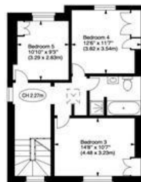
Second Floor (63.02 sq m)