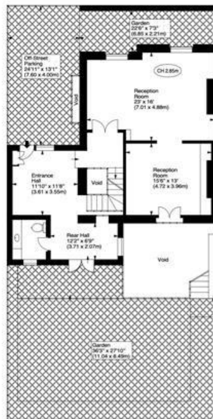
Ground Floor (90.52 sq m)