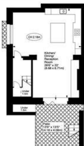
Lower Ground Floor (57.21 sq m)