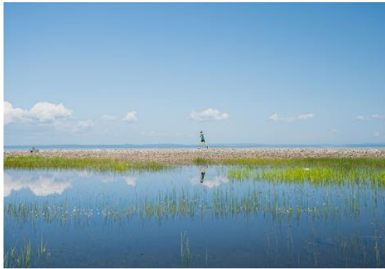
Caption 6: Running at gorgeous Lake Hovsgol.