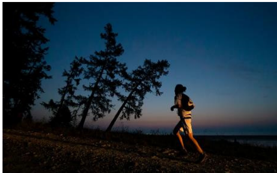
Caption 2: Early morning start at the lakeshore.