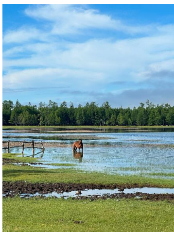
Caption 9: A horse cools down right next to Toilogt Camp, the site of the start and finish of MS2S.