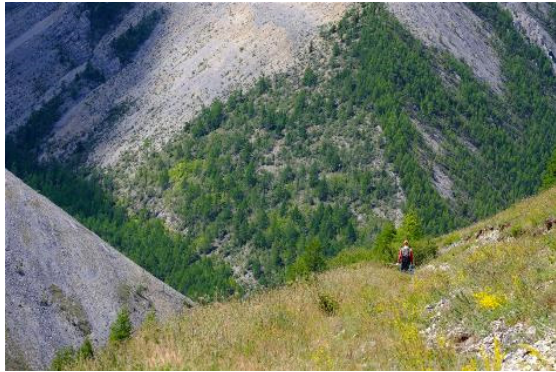
Caption 5: Raw nature: Running in the Mongolian mountains.