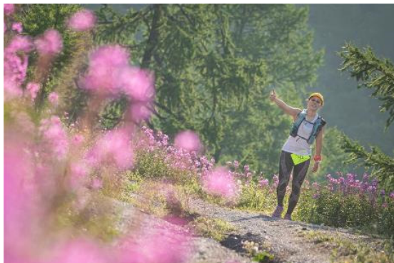
Caption 3: Wildflowers and untouched nature: That's the beautiful MS2S course!