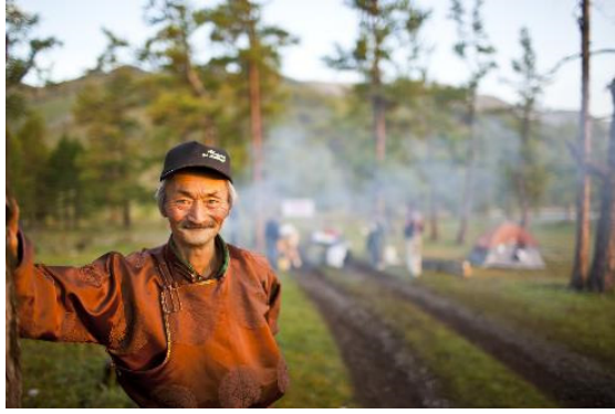
Caption 4: Mongolian horsemen serve as race marshals and guide the runners.