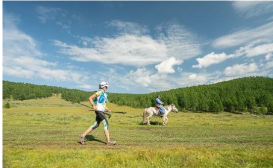
Caption 1: Mongolian adventure: MS2S is one of the world's most beautiful trail runs.

→ This was the 2022 MS2S race week: https://www.youtube.com/watch?v=aGeyfsB15aE