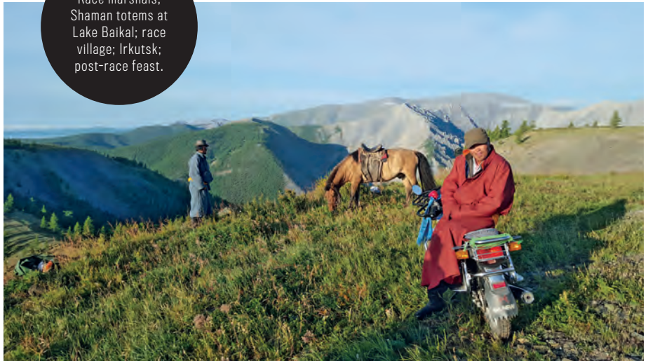
Clockwise: Race marshals; Shaman totems at Lake Baikal; race village; Irkutsk; post-race feast.

In contrast to some of the bigger, more crowded European races, what followed was more intimate and relaxed. The start was cool and peaceful. Headlamps bobbed through the forest, and then the