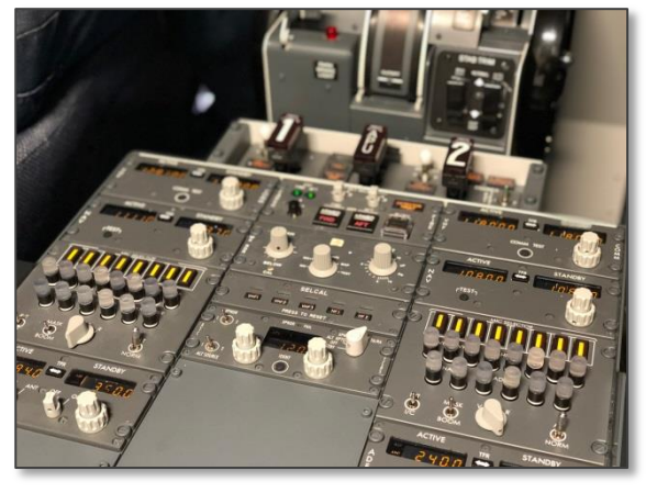
Xalarer 6<sup>t</sup> Full-Motion Flight Simulator B-737 NG | Technical Description Document | July 2018