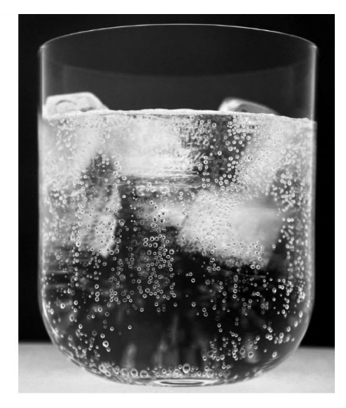
Amanda Means, Water Glass 62 / Water Glass 64, 2023. Gelatin silver prints, 117 x 96.5 cm, each.

The work of Means is essentially photomechanical and that of Gielkens hand-painted. But contrary to endorsing these established classifications, the joint exhibition brings out a different insight: in the practice of both, there is an important emphasis on the role of light in relation to seriality as an artistic strategy. Instead of deriding redundancy or overabundance, which motivated Pop Art, or extolling uniqueness, which defined Expressionist fine art, Means and Gielkens use repeated forms to accentuate small differences in appearance. They draw attention to an irrevocable part of the ordinary in the special and the treasured, and trace what might otherwise perish. By capturing the magic effect of light in the poetic effect of their art, Gielkens and Means say something poignant and timely: their celebration of light becomes a reflection on the ways of, and a reminder of the need for, remembering and safeguarding.