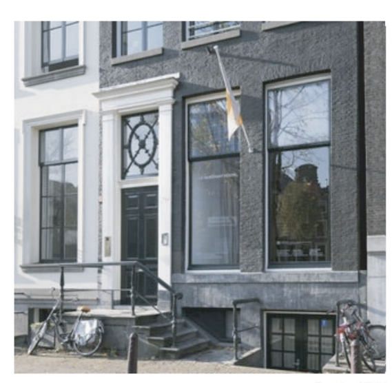
Façade of TMH with the Flag of Compassion of Rini Hurkmans