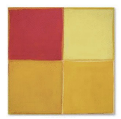
Beppie Gielkens, Untitled , 2022/23. Tempera on cotton, 45 x 45 cm, each.