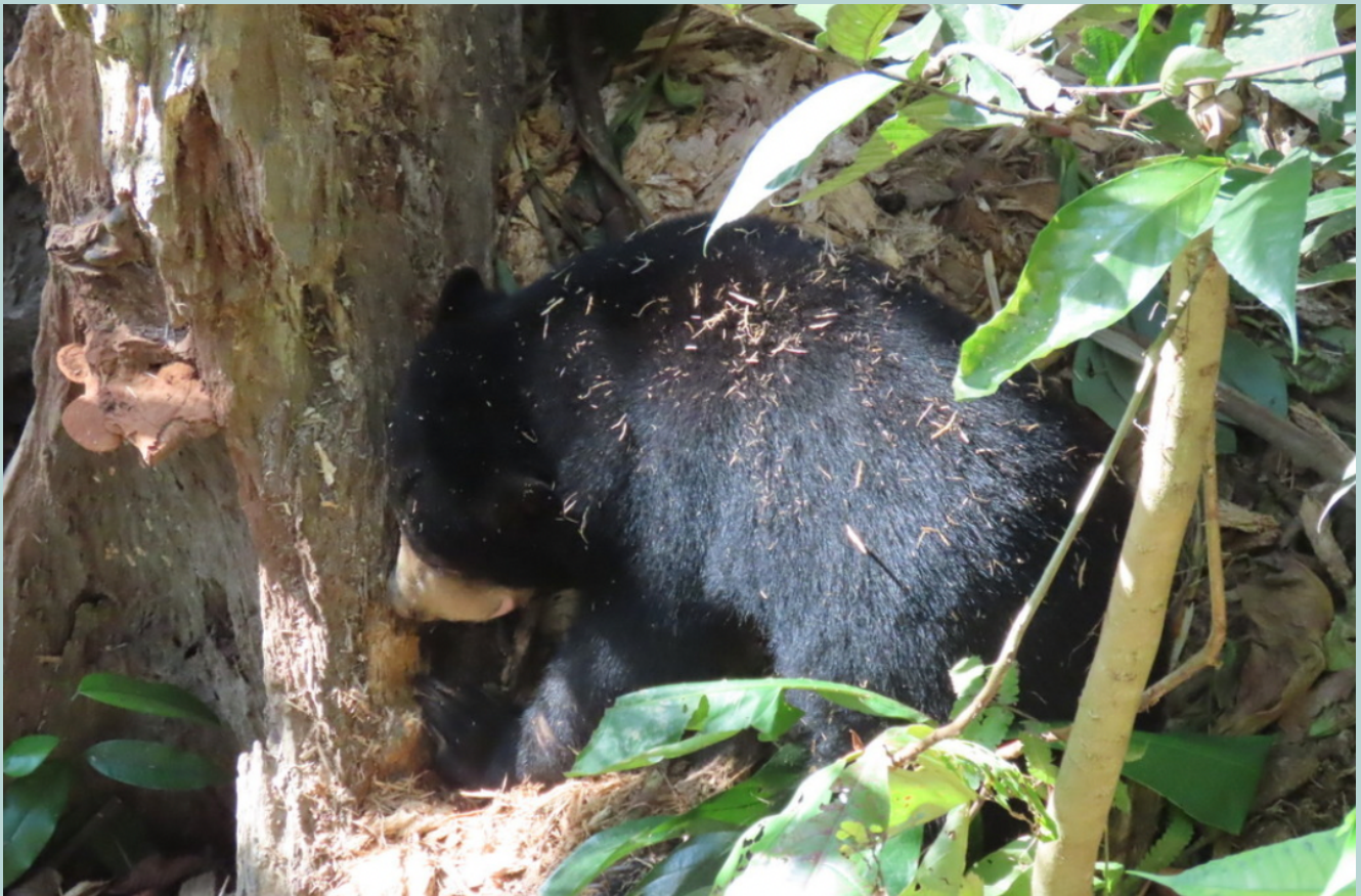
Sun bear photographed in Malaysia in 2019.

Traders are aware of these flaws and manipulate them to their advantage by moving many of their transactions online to Facebook and other social media platforms, which are more difficult for law enforcement to monitor and regulate. Traders can easily set up multiple anonymous social-media accounts and secret trade groups. Face-to-face meetings between seller and buyer are no longer required, as payment can be transferred online and goods can be shipped directly to the buyer. The convenience of these transactions makes it more difficult for authorities to connect buyers and sellers, which could later be used as evidence in court.