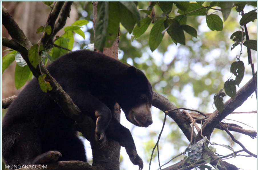
A sun bear in a tree in Malaysian Borneo, its strong claws visible.

Along with a local demand for sun bear parts such as claws, teeth, skins, skulls or stuffed whole specimens, there's also the sale of claws and teeth on social media, both in their natural forms and carved into intricate designs or crafted into pendants.