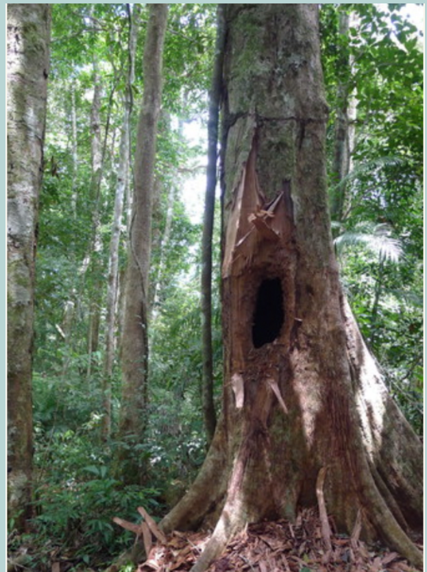
A hole carved in a tree by a sun bear.

But their ecological significance is trumped by the contraband worth of their parts, which are highly valued by humans as trophies and charms and for use in traditional medicine.