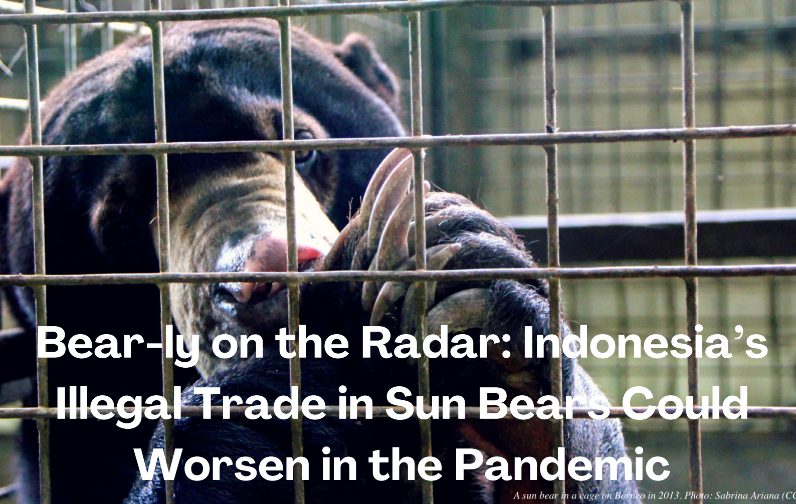
A sun bear in a cage on Borneo in 2013.