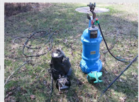
Sithe Chopper replacing existing Non-Clog Pump.