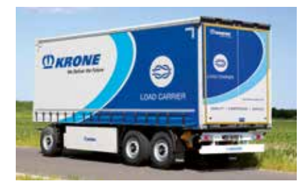
3-axle drawbar trailer. In sliding curtain design.