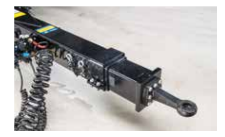
Drawbar wale with adjustable length.

The adjustable drawbar wale enables coupling at different lengths to the tractive unit.