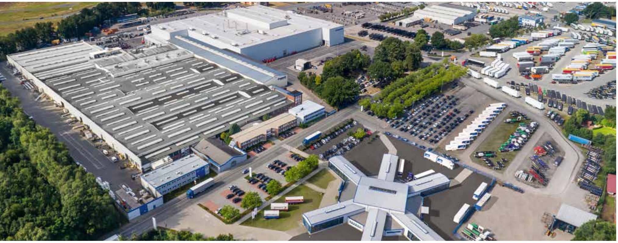
Production facility Werlte (Germany)