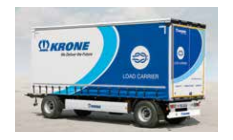
2-axle drawbar trailer. In sliding curtain design.

Tail lifts from different manufacturers, in upright or foldable design, are available.