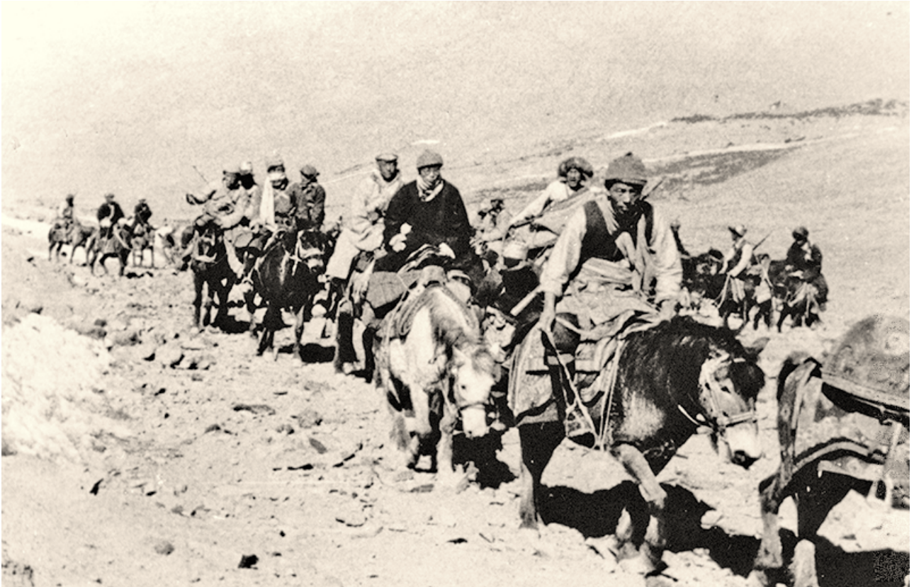
H.H. Dalai Lama XIV Crossing the Himalayas from Tibet to India, 1959

This year, 2009, it is 50 years since H.H. Dalai Lama and over 100,000 Tibetans became homeless.