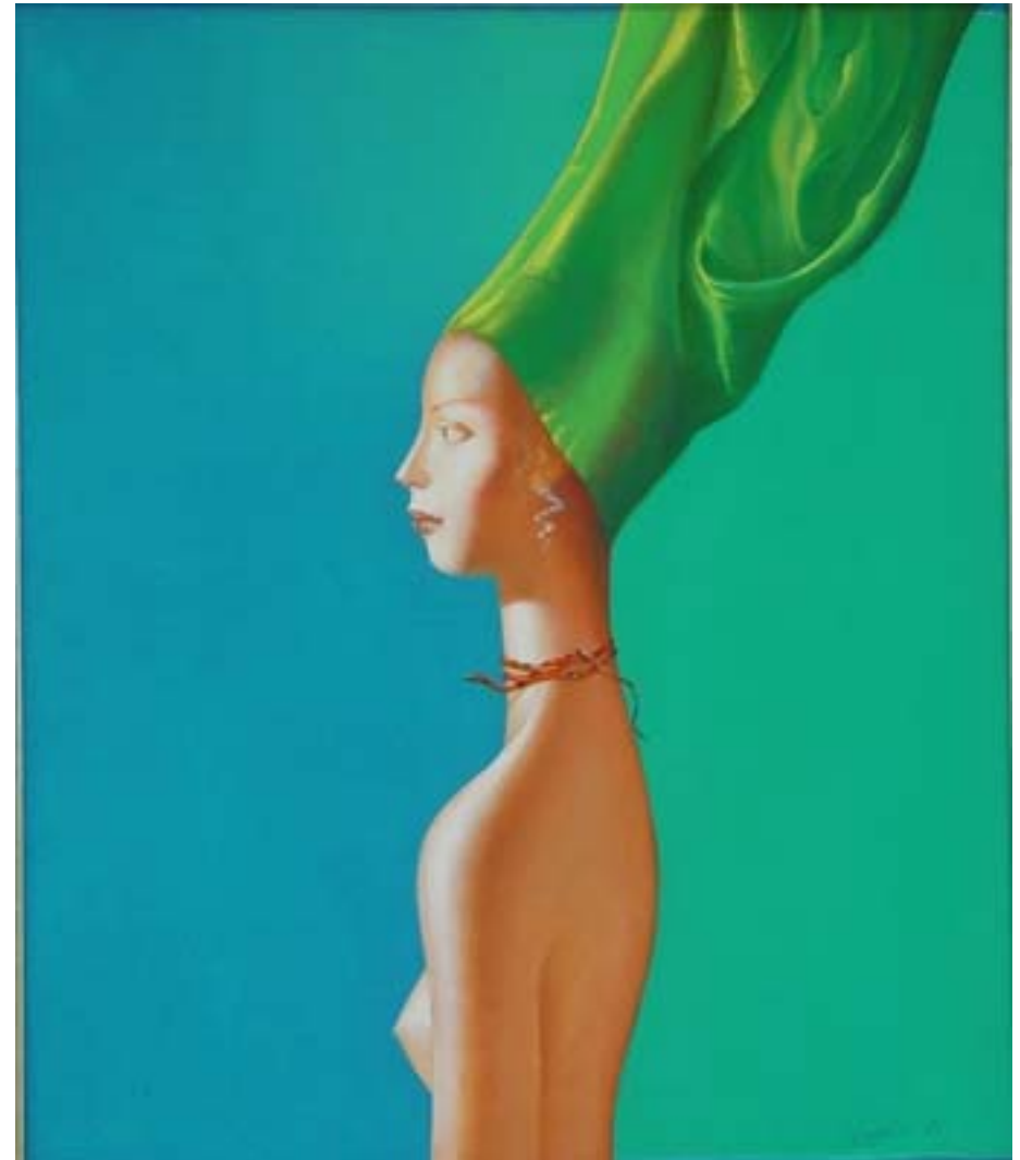
Eva with snake / oil on canvas / 80x70 cm