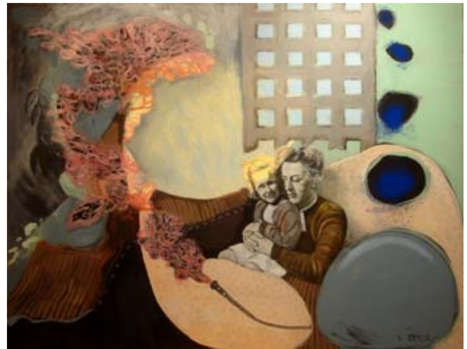
Mother / oil on canvas / 89×116 cm