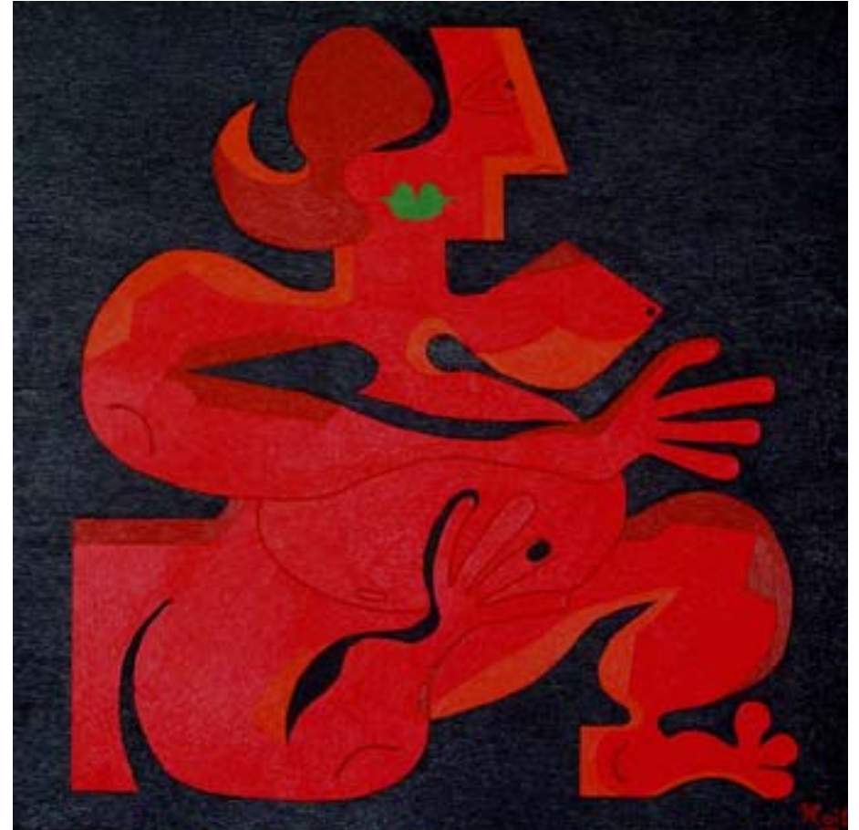
Ruby in Black / oil on canvas / 100×100 cm