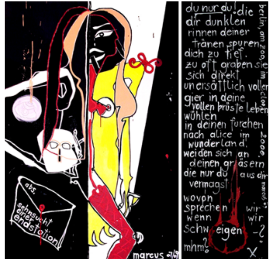
„Berlin, am zoo, im cloo“ / acryl, oil, canvas / 150×100 cm + 150×50 cm