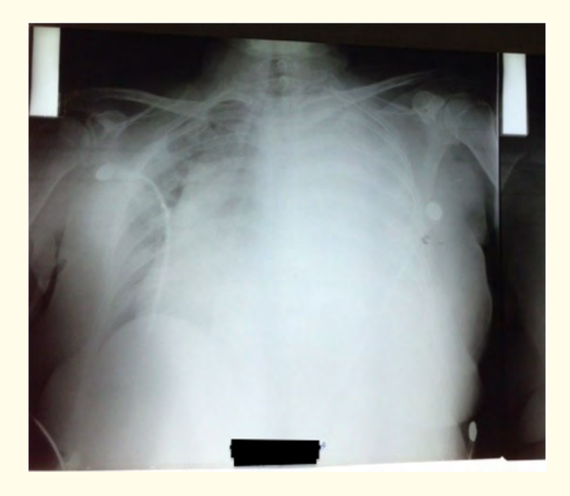
Figure 1: Preoperative chest radiography, showing opacity of the left haemithorax. Trachea and the heart are shifted to the right.

Her symptoms started more than 12 months before first presentation to hospital. Initial biopsy was taken at an overseas hospital, which showed lymphoma, a second biopsy at her local hospital showed benign fibroma. However she was refused surgery due to very large mass and deteriorated clinical condition.