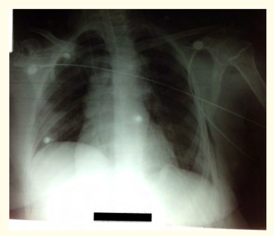
Figure 3: Postoperative chest radiography, showing reexpansion of the left lung. Trachea returned to normal position and the heart started to shift towards the left. Two chest drains are seen in the left haemithorax.