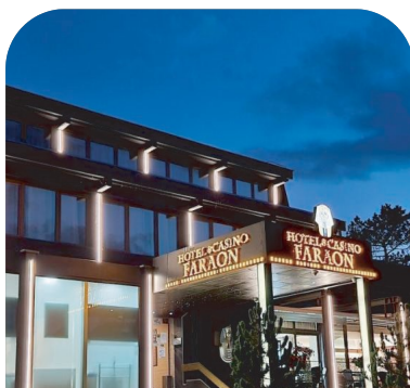
Hotel Faraon 3*

E: hotel.faraon@siol.net (Subject: Karate)