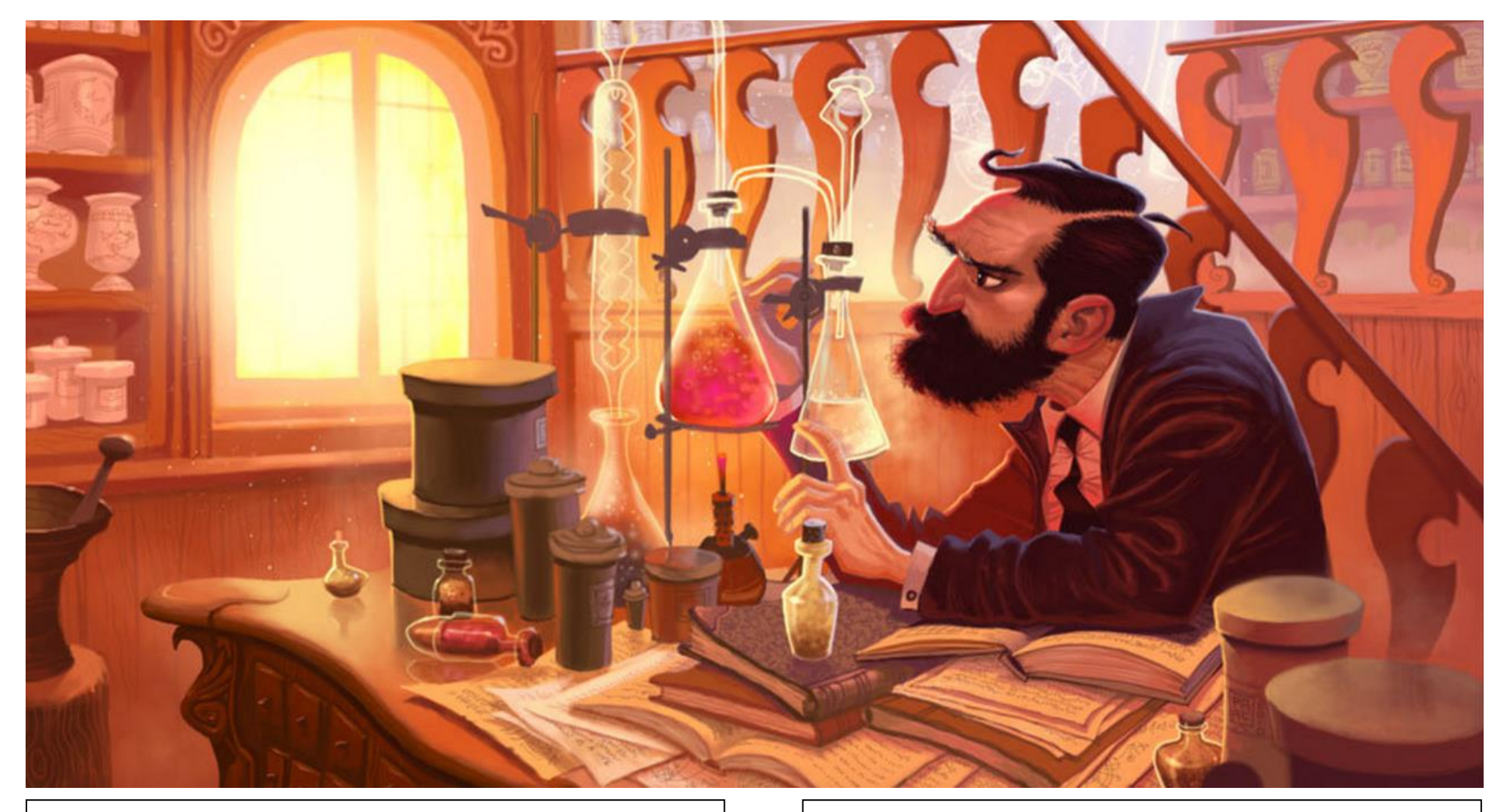
Option 1: Write a recipe for the magic potion in the picture