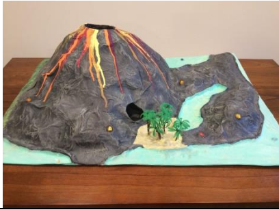
1) Paper Mache

Look at the images of existing products and the materials they were made from. For each write about what you like about it and what might be a problem.