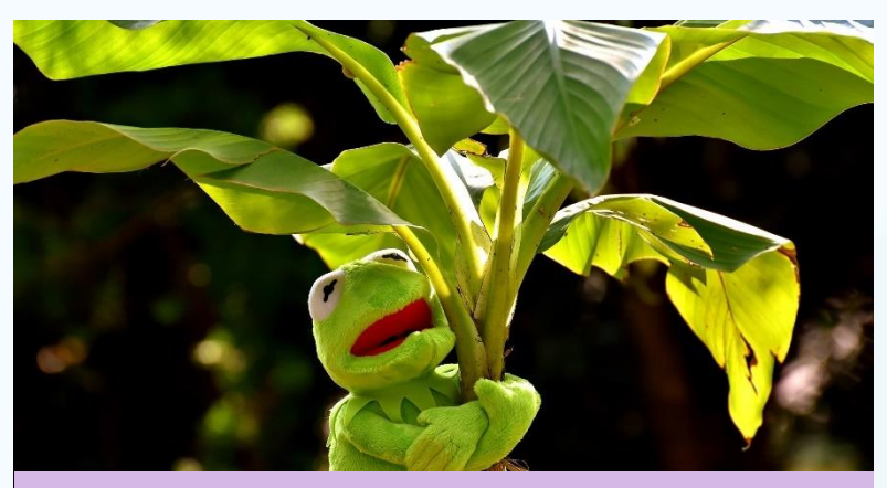
With fear in his eyes, Kermit clung to the high tree and continually called for help.

Can you use adverbials of frequency and manner when describing these images?