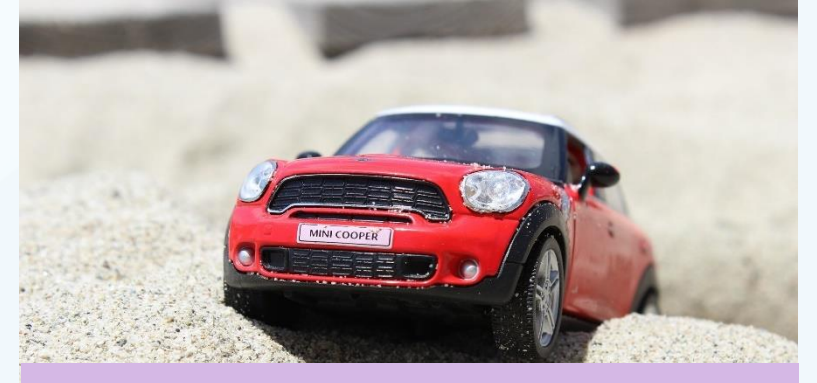
Although he was driving over the sand cautiously, every now and then the car wheels got stuck.