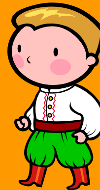
Girls and boys