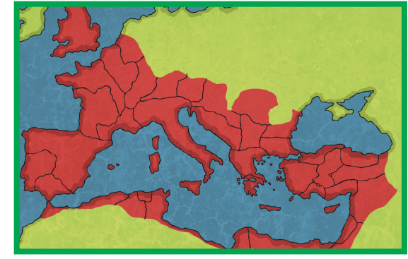
The Roman Empire in AD 117

However, many soldiers fighting in the Roman army did not come from Rome itself. Instead, they came from one of the many countries which were part of the Roman Empire. The Roman Empire included parts of Europe, North Africa and the Middle East.