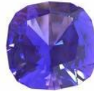
Sapphire Keeping focus