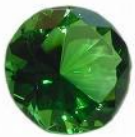
Emerald Learning with a partner