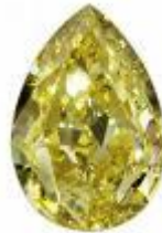
Diamond Independent thinking