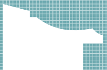
1861 30x20 mm