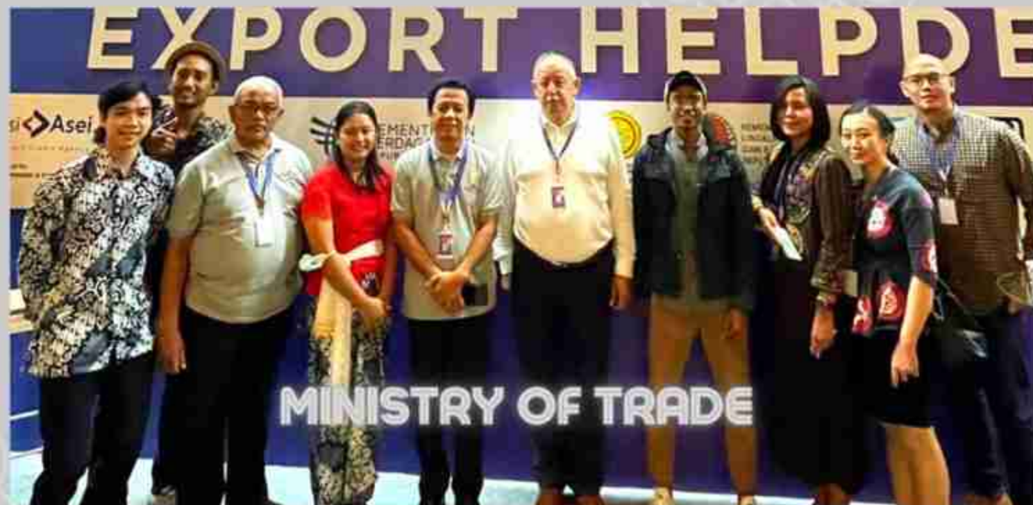
MINISTRY OF TRADE