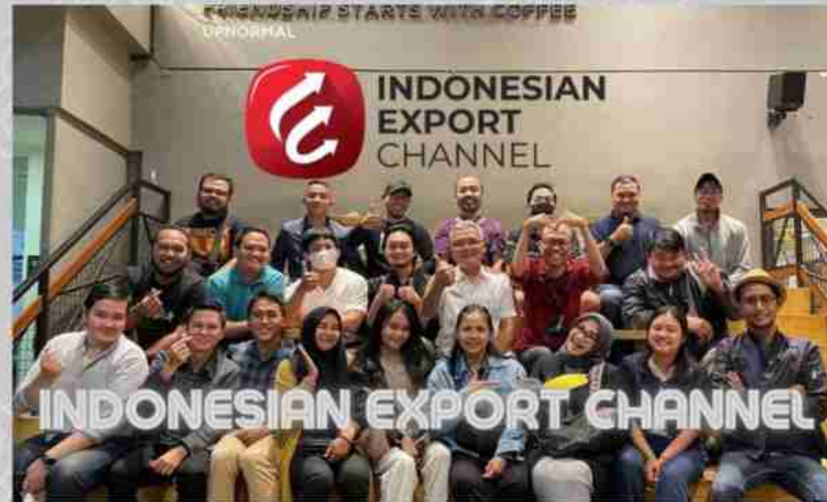
INDONESIAN EXPORT CHANNEL