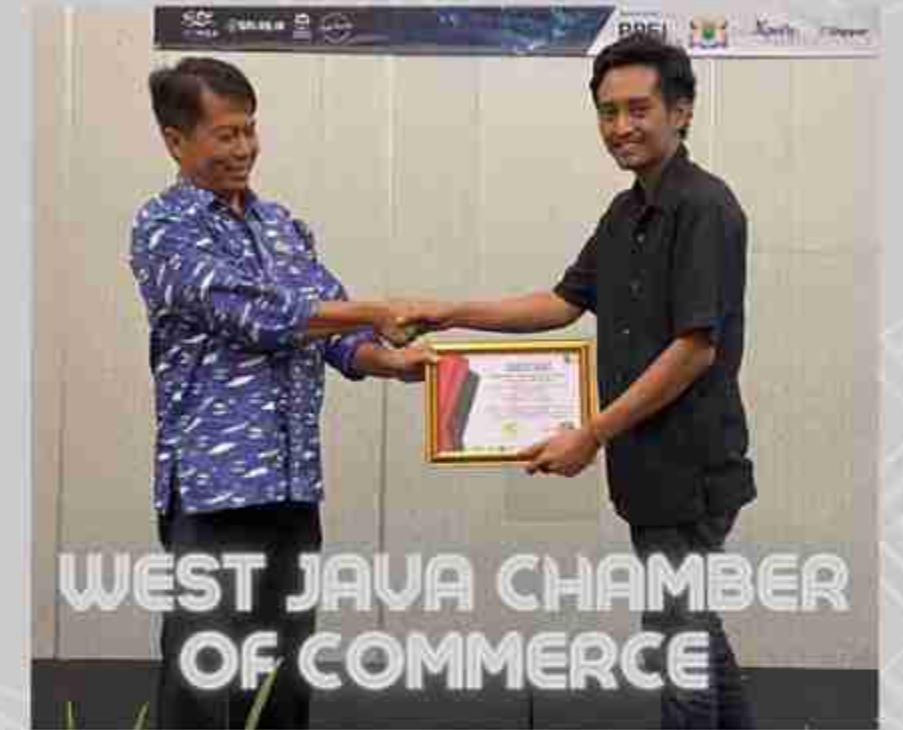
WEST JAVA CHAMBER OF COMMERCE