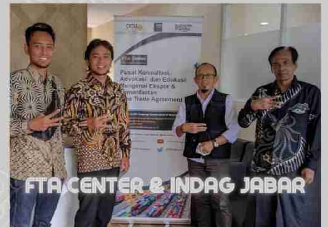
FTA CENTER & INDAG JABAR