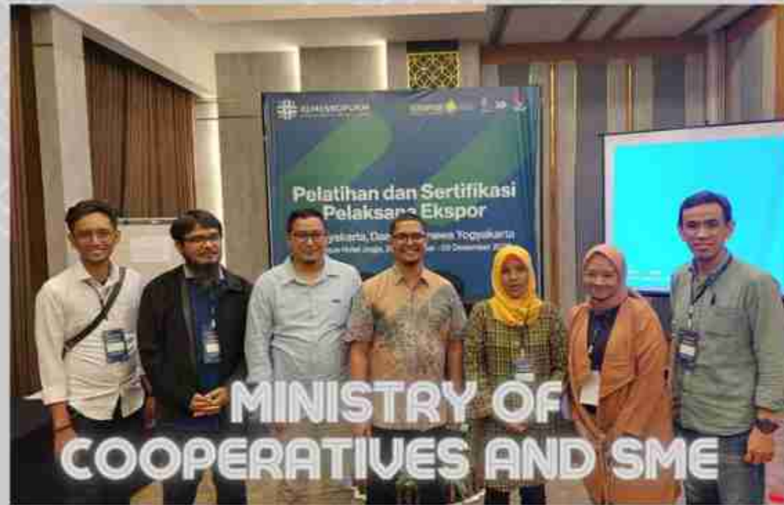
MINISTRY OF COOPERATIVES AND SME